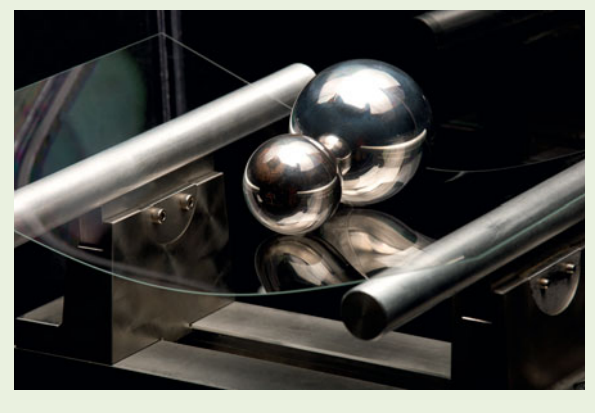
A piece of Corning's Gorilla Glass undergoing a flexibility test in the laboratory.

In theory, basic research within a big company doesn't have to cross a valley of death before becoming a commercial product. But there are still plenty of in-house hurdles to jump. "Most big companies operate using some sort of stage—gate process," explained Paul Drzaic of Apple Inc. "New developments are tested with incrementally more challenging goals and larger expenditures, with the option to kill a project or pass [it] to the next stage."