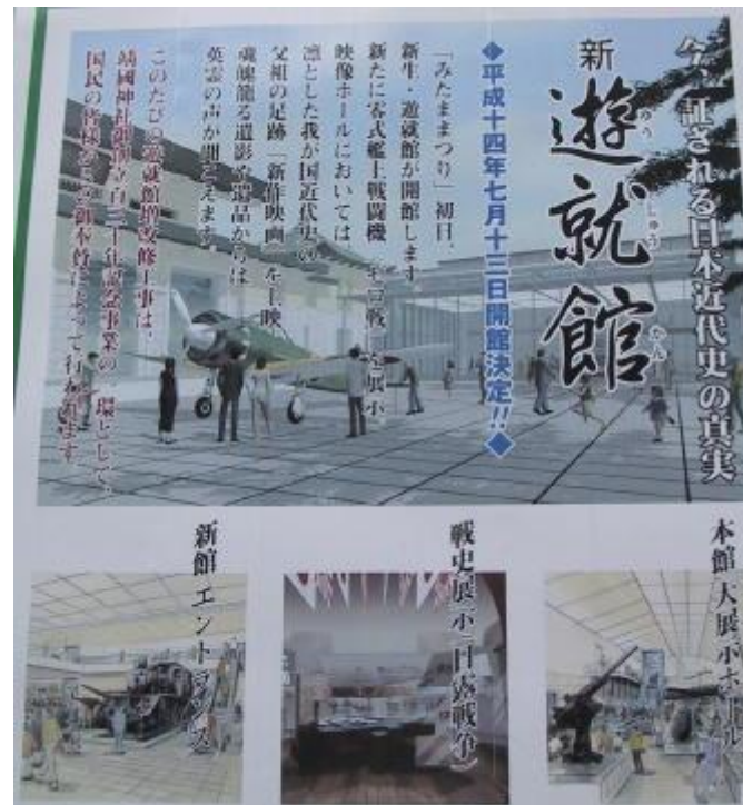
Yushukan war history exhibits at Yasukuni Shrine

While most revisionist accounts are available only in Japanese, some have also appeared in English since the 1990s. As the history and memory of the NM became internationalized, the Japanese revisionists have attempted to convince the world that what is known as the NM has been falsified. The spirit of these revisionist versions has much in common with some equally emotional, nationalistic, and ethnocentric statements about Nanjing that have emanated from China and the United States. Indeed, each has fed off the others. In China, many accounts and museum exhibits dealing with Nanjing have fostered a self-congratulatory nationalism, calculated to strengthen loyalty to the government while paying scant attention to the facts, as opposed to reiterating an iconic position such as the 300,000 deaths. The same may be said, from across the ideological barricades, of the Yasukuni Shrine's museum presentation of the Pacific War with its complete lack of reference to Japanese atrocities. Moreover, some American works on Nanjing have ascribed the atrocities to an alleged Japanese racial character or unique cultural behavior, ignoring the widely shared racist thought that lay behind the war's savagery. [7]