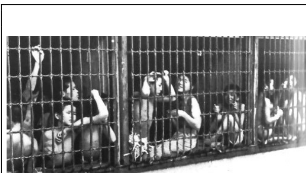
Children caught and detained through

There was another "problem" with this figure of 123, 511: children of broken and/or impoverished families, whose parents were alive, may have been included in the number "by mistake," largely because they were on the street just like sensō koji . They were called furōji [juvenile vagrants]. For the postwar government, it was essential to separate furōji from sensō koji , because the former were suspected of disturbing public peace and social order. The editorial of the journal Shakai Jigyō [Social Work] published in 1946 insisted that most furōji (浮浪児) had already become furyōji (不良児), that is, "juvenile delinquents." In the same journal published in 1948, Takeda Toshio, a social worker, wrote, "Even though we call them sensō koji , more than 40 percent of them have already become furōji (1948: 1). These reports created what I call sensō koji-cum-furōji . They were "hunted, rounded up and captured" ( karikomi ) by the police, and sent to shelters, prisons or relatives (if any were willing to accept the child). 11 However, many quickly ran away from those facilities, and returned to what Yoshioka Genji later called "the land of freedom," the places they inhabited before being captured (1987). The reports indicated that sensō koji-cum-furōji committed such crimes as theft, pilferage, embezzlement, arson, black-market trading, gambling, prostitution and consuming and selling illegal drugs. 12