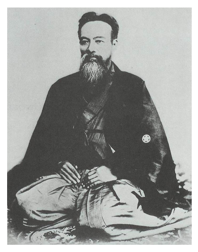
Yamaoka Tesshu, founder of the Shumpukan School of swordsmanship.

Ichiko was not exactly an exception. Yamaoka Tesshu looked into the past when he established his Shumpukan School of swordsmanship in 1880. There, beginning students went through 1,000 consecutive days of practice, an idea straight from Miyamoto Musashi's Book of Five Rings, and ended it with a final exam of 200 consecutive contests, all held within a 24-hour period. (The highest level examination consisted of 600 matches in three consecutive days.) This regimen was designed to achieve a state of "selflessness," which Tesshu defined as the "essence of Bushido." [ii]