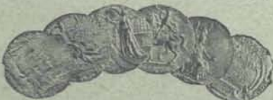
Gold Medal Allahabad 1910.

Paris 1900, Brussels 1910, Buenos Aires 1910.