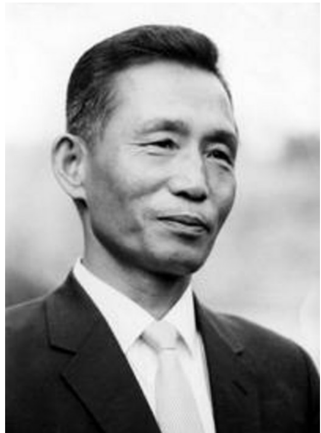
Park Chung Hee as a patriotic and modest leader

the military supplies base in Pusan (1960), where military supplies from the U.S. Army were nationally distributed, he allegedly did not accept the numerous kickbacks offered by army purveyors. Because this base involved ample material benefits in a war-torn country, high-ranking officers there were particularly close to the political elite. These military officers used their control over base resources to bolster the ruling Liberal Party during each election, in exchange for their affluent lifestyle and political influence. Park reportedly refused to comply with the conventional practice of corruption among high-ranking military officers and did not play the political game with them; as a result, his assignment ended abruptly after six months, despite the fact that his tenure there was supposed to last for two years. 45