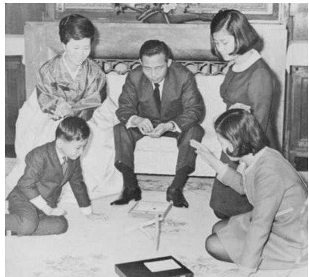
Park Chung Hee with his wife and