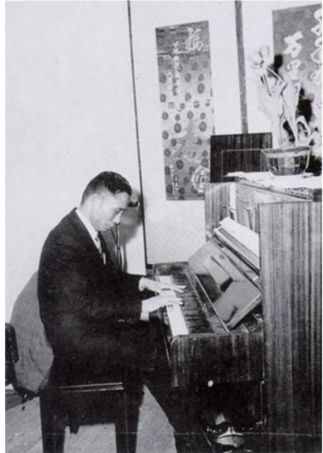
Park at the piano.