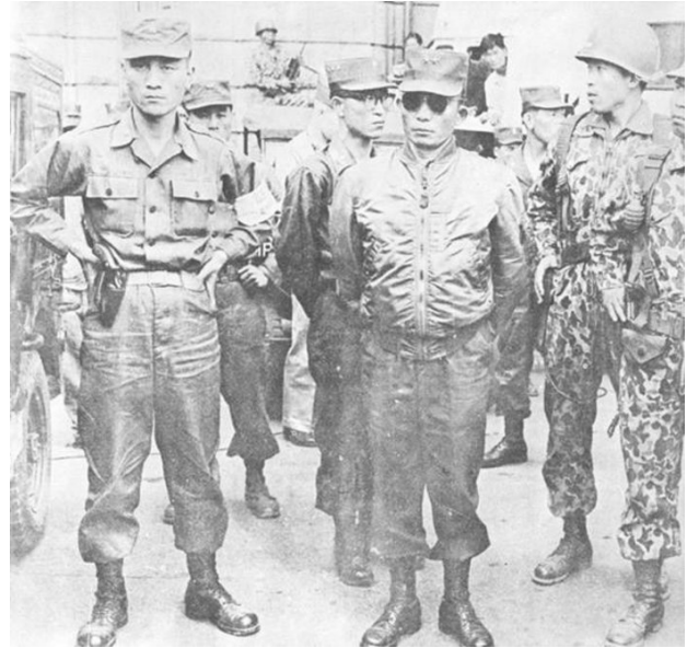
Park Chung Hee during the military coup in May 1961.