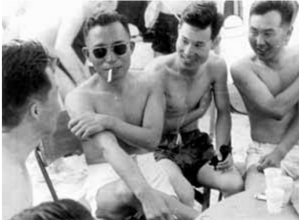
Park Chung Hee (with sun glasses) with two journalists and the mayor of Pusan (the first from the right) in the Haeundae Beach, Pusan in the early 1960s (description based on Un-hyŏn Chŏng's Silrok Kunin Park Chung Hee (2004), p. 211. (Cyber Park Chung Hee memorial hall established and managed by the City of Kumi, North Kyŏngsang Province)