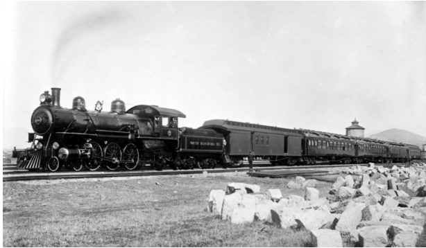
South Manchurian Railroad . . . symbol of Japanese power and industrialization