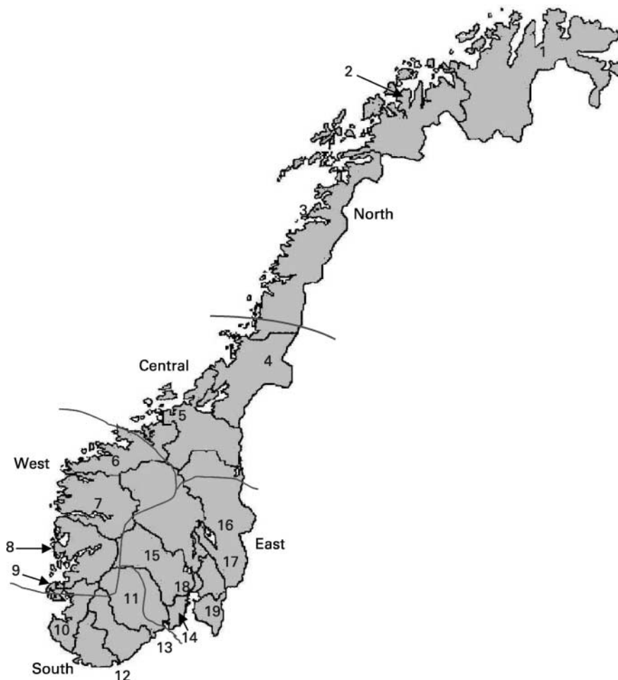
Fig. 1. Map of Norway showing positions of the nineteen dairies where low-fat milk and organic milk were sampled. For locations of the dairies 1–19, see Table 1.

Furthermore, processed dairy products were collected during the summer season. Among the samples analysed were extra-low-fat milk (7 g fat/l), curdled milk (38 g fat/l) and probiotic milk with Lactobacillus rhamnosus GG (Biola; TINE, Oslo, Norway; 15 g fat/l), dairy products such as yoghurt (32 g fat/l), soured cream (200 g fat/l) and cheese. Several types of cheese were analysed, i.e. Jarlsberg (270 g fat/kg), Norvegia (270 g fat/kg) and whey cheese (Tine Gudbrandsdalsost; 290 g fat/kg). These three cheeses account for approximately 60% of the cheese sales in Norwegian grocery shops (AC Nielson, unpublished results).