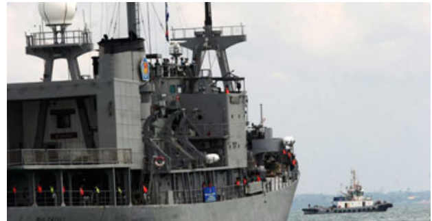
An Indonesian navy ship patrols the Straits

safety in the Straits, Indonesia has called for international burden sharing as provided for by the Article to be enhanced and expedited [4]. From its perspective, any discussion of the subject should include both the littoral and user states, and should never undermine the sovereignty of the latter.