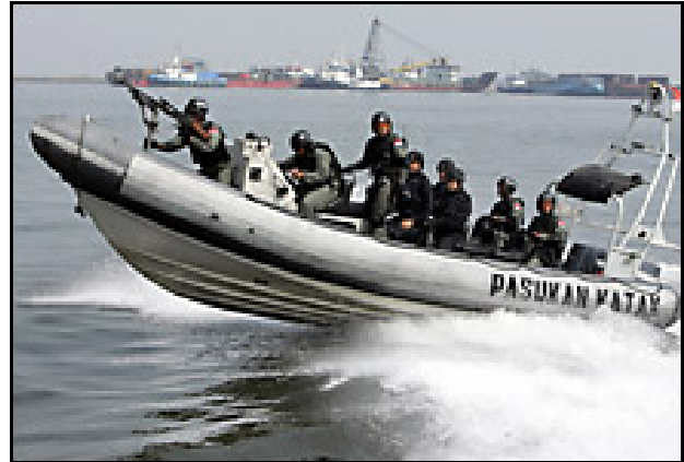
The navies of Singapore and Indonesia hold a joint exercise in August 2006

Since 9-11, many steps have been taken to improve security in the Straits. These include the MALSINDO coordinated patrol by the navies of the littoral states, the 'Eye in the Sky' air surveillance over the Straits, the creation of the Malaysian Maritime Enforcement Agency (MMEA), and increased patrols conducted by the littoral states.