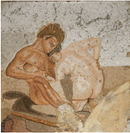
Fig. 5. Symplegma mosaic from cubiculum 17 of the House of the Faun, h. 39.0 cm, w. 37.0 cm. MANN, inv. 27707.