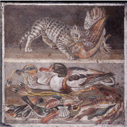
Fig. 7. Emblema from ala 15 of the House of the Faun, with split-level composition including the cat-and-bird motif, h. 51.0 cm, w. 57.0 cm. MANN, inv. 9993.