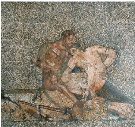
Fig. 6. Symplegma mosaic from Thmuis (Tell Timai) in the Nile delta. Central panel h. 82.5 cm, w. 84.5 cm. Alexandria, Graeco-Roman Museum, inv. 21738.

Eight pictorial mosaics were laid in the House of the Faun as part of a major renovation program of the early 1st c. BCE (Fig. 3). 42 As previous studies have recognized, 43 several have iconography linking them to Ptolemaic Egypt: