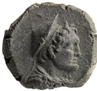
Fig. 10. Clay seal impression from Edfu, depicting Ptolemy I Soter wearing kausia, diadem, and aegis. Allard Pierson Museum, inv. 8177-230.