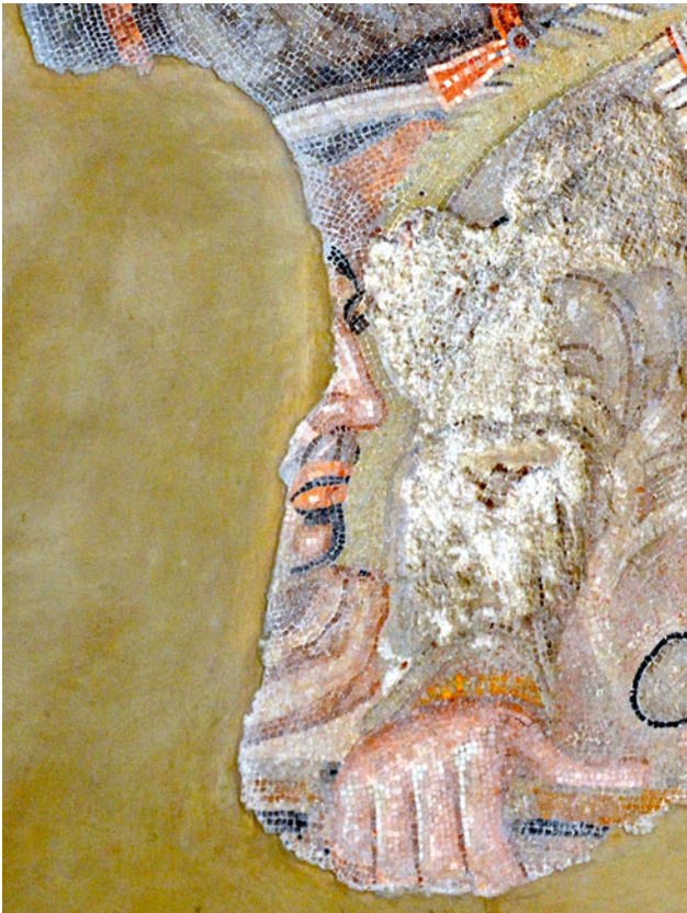
Fig. 2. Detail from the Alexander Mosaic, showing the right-hand man's portrait. MANN inv. 10020.

emphasize his special relationship with the king. These conditions best suit one of the protagonists in the power struggle that followed Alexander's death: a figure with the standing of Ptolemy I Soter, Seleukos I Nikator, or Lysimachos. Rumpf tentatively proposed, on iconographic grounds, that the figure might represent Ptolemy.