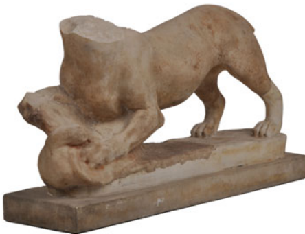
Fig. 8. Marble statue of a cat attacking a bird. Probably excavated in the Bouabastion at Naukratis, h. 23.0 cm, w. 12.0 cm, l. 49.5 cm. British Museum, inv. 1905,0612.5.