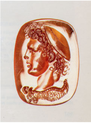
Fig. 9. Carnelian intaglio from the House of the Faun, with portrait of royal (?) figure wearing hemispherical hat and aegis, h. 2.24 cm, w. 1.71 cm. MANN, inv. 26766. (After Pannuti 1983, fig. 14. )