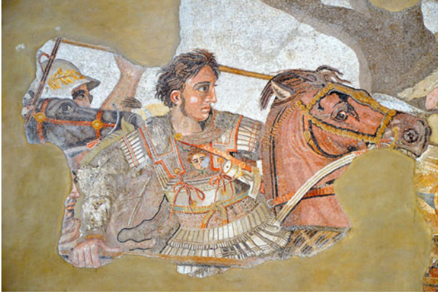
Fig. 1. Detail from the Alexander Mosaic, showing Alexander riding Boukephalos and the right-hand man standing directly at his side. MANN inv. 10020.