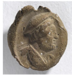
Fig. 11. Clay seal impression from Edfu, depicting a Late Ptolemaic ruler wearing kausia, diadem, and aegis, h. 1.40 cm, w. 1.30 cm. Royal Ontario Museum, inv. 906.12.68.

Our knowledge of Boubastis in Hellenistic Egypt has been enhanced by the discovery of the Alexandrian Boubasteion during rescue excavations at Kom-el-Dikka in 2009–10. 58 The sanctuary was first founded in the late 4th or early 3rd c. BCE, but a series of six foundation plaques record a major renovation by Berenike II, sister-wife of Ptolemy III Euergetes. 59 This royal initiative accords well with the Canopus Decree of 238 BCE, which reveals that the Boubasteia was moved to coincide with the Euergesia, a Ptolemaic dynastic festival. 60 Excavations in the sanctuary uncovered a series of pits containing offerings that had been dedicated to Boubastis prior to burial. Three pits contained limestone and/or terracotta cat statuettes comparable to the examples from Naukratis: one with 50 limestone cats and 469 terracotta cat figurines; another with 106 limestone cats; and a third with 13 limestone cats. Many reproduce the cat-and-bird motif familiar from the House of the Faun emblema, further suggesting a specifically Egyptian connection.