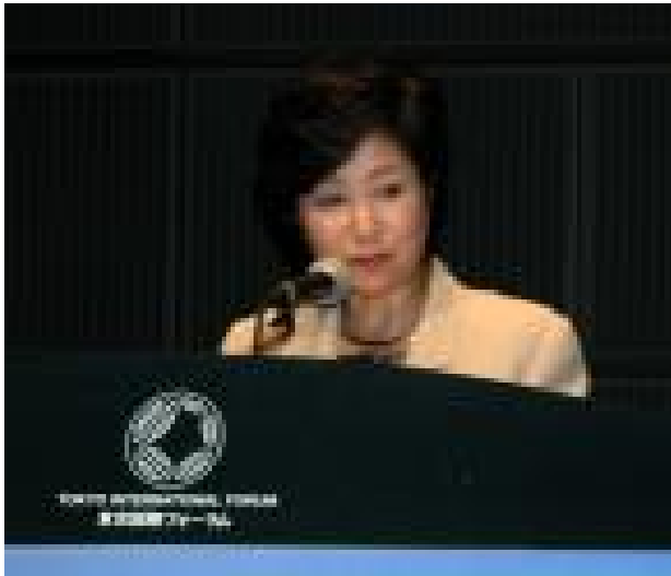
Environment Minister Koike Yuriko

Even the chairman of Chisso was present. For the past half-century, Japan's, and the world's, environmentalists have cursed the name of Chisso. This is the company that caused Minamata Disease by dumping organic mercury into the bay, and then denying responsibility when the first victims appeared. This is the company that twisted the arms of the first impoverished victims back in 1959, forcing them to sign an agreement saying they would not sue Chisso even if in the future the company was found to be the cause. In return, they got payments of between 30,000 and 300,000 yen, minuscule sums, yet more money than most had ever seen.