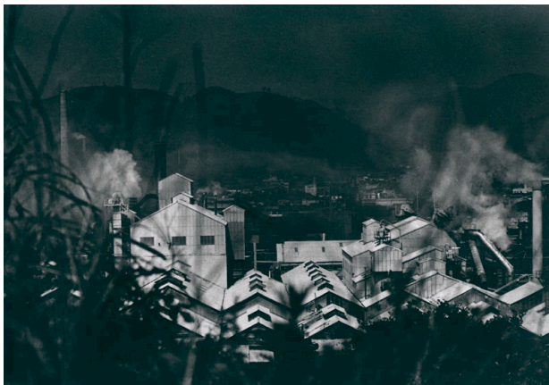
The Chisso Minamata plant

Even the chairman of Chisso was present. For the past half-century, Japan's, and the world's, environmentalists have cursed the name of Chisso. This is the company that caused Minamata Disease by dumping organic mercury into the bay, and then denying responsibility when the first victims appeared. This is the company that twisted the arms of the first impoverished victims back in 1959, forcing them to sign an agreement saying they would not sue Chisso even if in the future the company was found to be the cause. In return, they got payments of between 30,000 and 300,000 yen, minuscule sums, yet more money than most had ever seen.