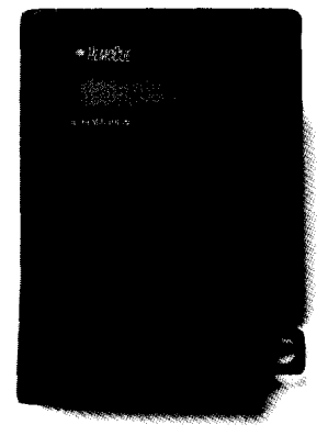
The Little Red Box

Instead of glass tubes which can shatter, break and leak, you can use an unbreakable plastic microcuvette.