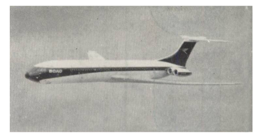
H. M. HOBSON LTD., FORDHOUSES, WOLVERHAMPTON, STAFFS.

PRINTED BY THE LEWES PRESS WIGHTMAN & CO. LTD., LEWES, SUSSEX, ENGLAND, AND PUBLISHED BY THE ROYAL AERONAUTICAL SOCIETY, 4 HAMILTON PLACE, LONDON, W1V 0BQ, ENGLAND.