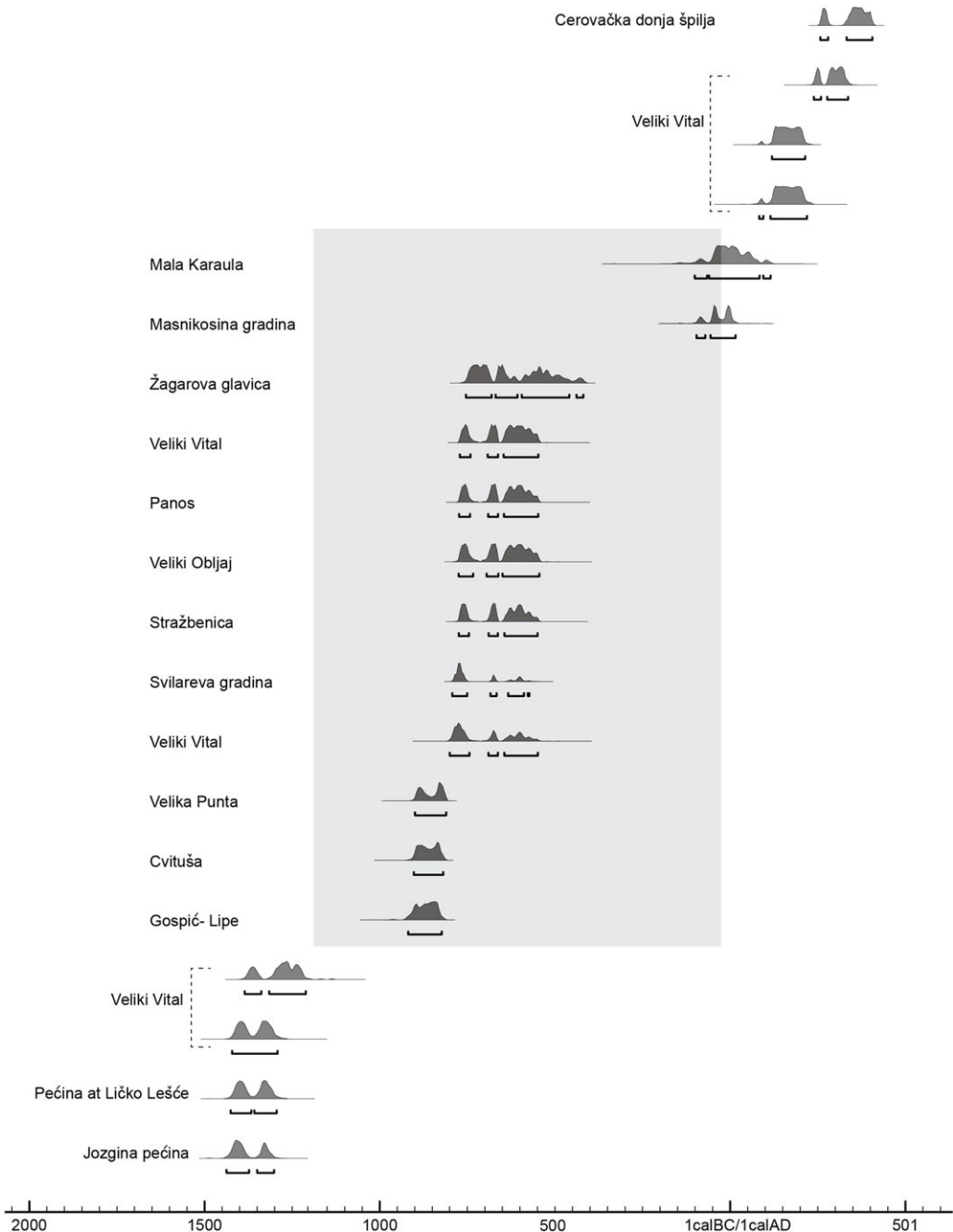
Figure 2. Calibrated AMS radiocarbon dates with period corresponding to the Iapodian cultural chronology (ca. 1200–35 BC) shaded in gray. Extreme outliers from Golubinjača, Jozgina pećina, and Pavlovac-Vrebački are not shown on this figure.

Once good preservation was established, radiocarbon samples (~2.5 mg) were combusted for three hours at 900°C in vacuum-sealed quartz tubes with CuO and Ag wire then sent to either the Keck Carbon Cycle AMS facility at UC Irvine (UCIAMS) or the AMS Radiocarbon Laboratory at The Pennsylvania State University (PSUAMS) for graphitization and measurement. Results were