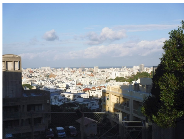
View of Naha from near the tomb of Shō Toku

Taikyū was almost certainly born in Goeku 越來 in central Okinawa, a son of the local warlord, and initially he was entombed in that area. However, his bones were moved several times, and in 1910 ended up far away, in Fusato [E] near Furi's tomb. Taikyū's daughter Momoto-fumiagari 百十踏揚 (d. ca. 1469-70), acclaimed in Omoro songs as a potent shamanic dancer, resides slightly north of Fusato, in Tamagusuku [F]. However, the remains of her husband, the powerful warrior Oni-Ōgusuku 鬼大城 (d. ca. 1469) are at Chibana Castle 知花城 [G] in the Goegku area, the homeland of Shō Taikyū. The last king of the dynasty, Shō Toku 尚徳 (r. 1461-1469), is portrayed in the official histories as both evil and fond of warfare. Such is the reputation of last kings in Confucian histories. His tomb is in the Uema 上間 district [H] on the outskirts of Naha, commanding a splendid view of the city below.