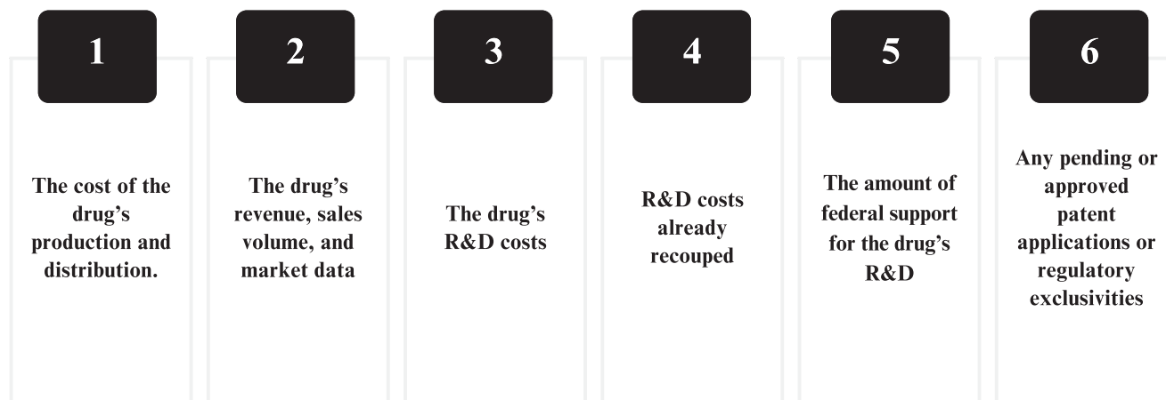
Figure 2. The Six Fairness Factors CMS Must Consider in Proposing an MFP.

manufacturer also must refer to these six factors to support any counteroffer.