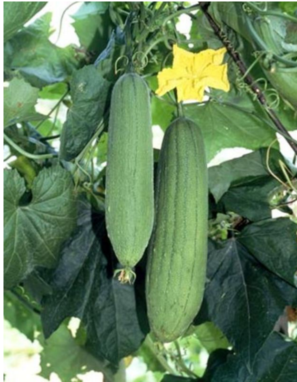
Sponge Cucumber Gourd

In a telling comment, Hino Keizō, one of the Akutagawa Prize committee judges, describes such passages as the story's final image of a dazzling hibiscus attached by a long vine to an enormous gourd as 'Okinawan' ( Okinawa teki ). 21 Kuroi Senji, another judge, similarly cites the spontaneous appearance of a crowd of villagers driven by curiosity to gather around Tokushō's home in hopes of learning more about his illness as the work's most striking feature. Such masses, Kuroi explains, have long been absent in Japanese fiction. 22 In Hino's comment, it is the oddity of "Droplets"—tropical flowers and vegetation redolent of the subtropics—that marks the work as 'Okinawan.' For Kuroi, presumably accustomed to stories of alienated city dwellers, the foreignness of crowd formation is what makes the work regional. Both judges' comments, patently orientalist in their dismissive categorization of difference, nevertheless elucidate Medoruma's knack for creating a vibrant place where, depending on