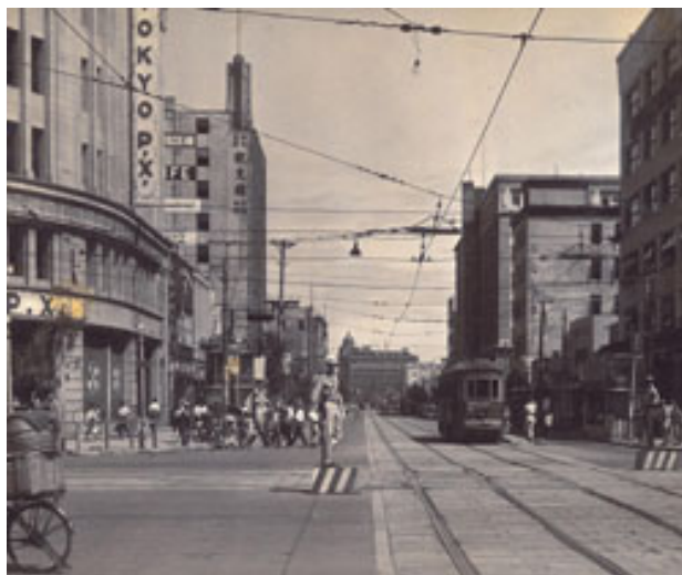
U.S. MP directs traffic in Ginza without cars in about 1947.

When you first get there everything seems different. The assumptions that people work on are not those you grew up with. You learn a different method of thinking. I still wake up in the morning wondering what I'm going to learn today. And I always learn something; I watch someone doing something and suddenly understand why, by putting everything I've learned before together. When I first came, it was daily. The first time I saw geta [wooden sandals], I didn't realize you were supposed to wear them on your feet. What you learn becomes more subtle, more sophisticated, the longer you stay; but the process is the same.