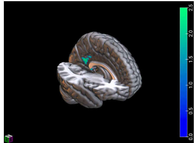
Figure 2. Data analyses with Longitudinal & Repeated Measures Neuroimaging Data (Guillaume et al., 2014), showed significantly increased engagement in the right retrosplenial cortex in the MT group compared to the Non-MT group over time (depicted in blue-green).

In order to investigate group differences in areas which potentially showed an increase over time during positive vs. negative ABM recall, we ran a repeated measure model using SWE method (Guillaume et al., 2014), which showed significantly increased engagement in the right rSC in the MT group compared to the Non-MT group over time (see Figure 2). We found no areas that showed a greater increase over time in the Non-MT group relative