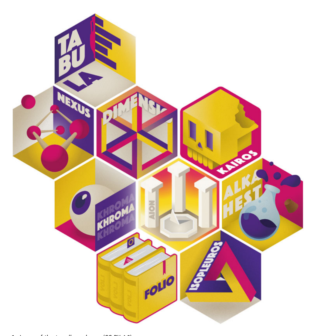
Figure 1. Logos of the tesselle packages (CC-BY 4.0).

The increasing use of R poses a number of new challenges for the archaeological community. These challenges can be grouped into two main categories, allowing us to distinguish between intrinsic and extrinsic difficulties in the use of programming languages—including R—in archaeology. Intrinsic difficulties pertain to the very use of programming languages and, in general, the use of