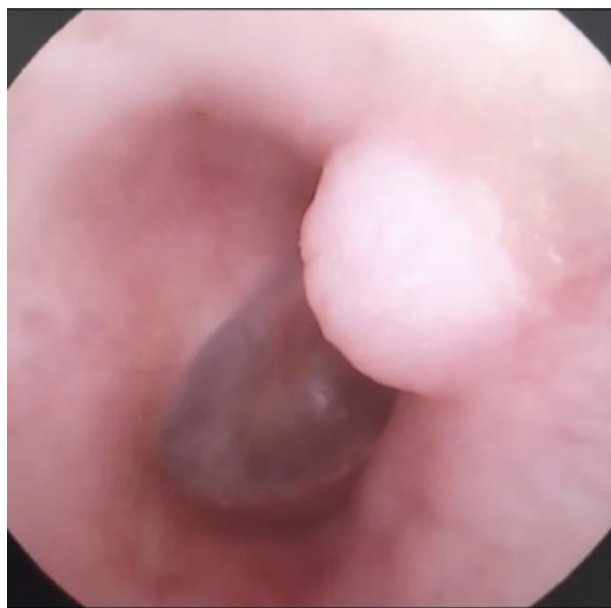
Figure 1. Endoscopic view of the right-sided external auditory canal lesion.

A computed tomography (CT) scan confirmed a defect in the right external auditory canal (Figures 2 and 3) with mucosal thickening in both maxillary antra. Magnetic resonance imaging (MRI) revealed an antero-superior bony defect (3.47 mm × 3.31 mm) within the right external auditory canal, with a small polyp connected to the right TMJ/parotid gland. To better characterise the bony defect, the radiology department suggested performing a CT scan during inspiration. This did not generate any improved images for review. As the patient's symptoms improved without treatment, she was managed conservatively.