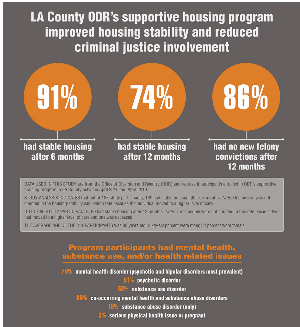
FIGURE 2. Preliminary data on ODR's permanent supportive housing program. 6

services. The majority of pregnant women served by ODR reside in specialized interim housing settings that allow women to remain with their children until they are moved to permanent supportive housing.