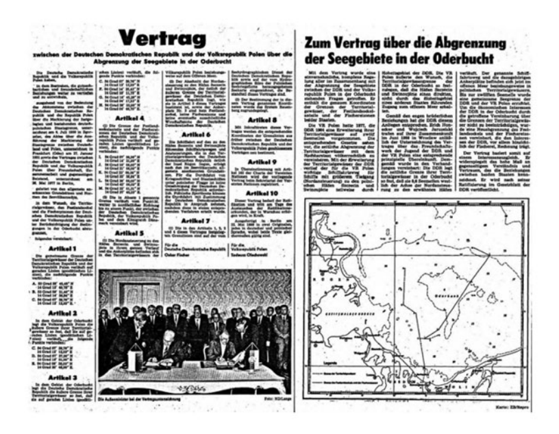
Figure 4. Treaty text and map, Neues Deutschland, May 23, 1989, pages 3-4.

(Poland's) politicians." The GDR might not get such a favorable offer if it waited until after the semi-free elections set for June 4, 1989.