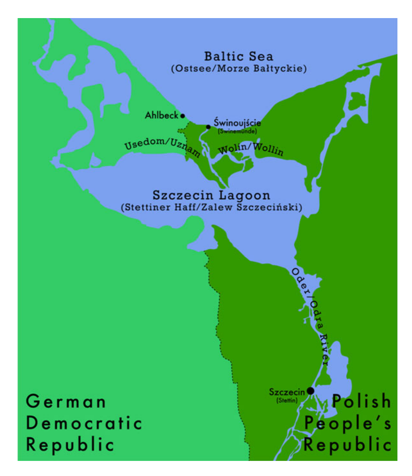
Figure 1. Map of Polish-German border waterways by Stettin/Szczecin.

and the border's proximity to Ahlbeck were "particularly unfavorable to us" and that Poland should "concentrate all energies on acquiring the entire island of Usedom," which was "extremely important [arcyważnej] to Polish interests." A member of the Maritime Board went even further, calling for Polish control of a ten- to thirty-kilometer-deep strip of the entire German coastline up to and including Rügen island. After hopes for such sweeping revisions evaporated, Polish officials continued to propose minor border changes near Świnoujście "on the basis of geological research" that could be interpreted in their favor. By the time SMAD turned over control of its occupied zone of Germany to a new GDR administration in October 1949, the matter of the water border was still unresolved and, indeed, already in dispute.