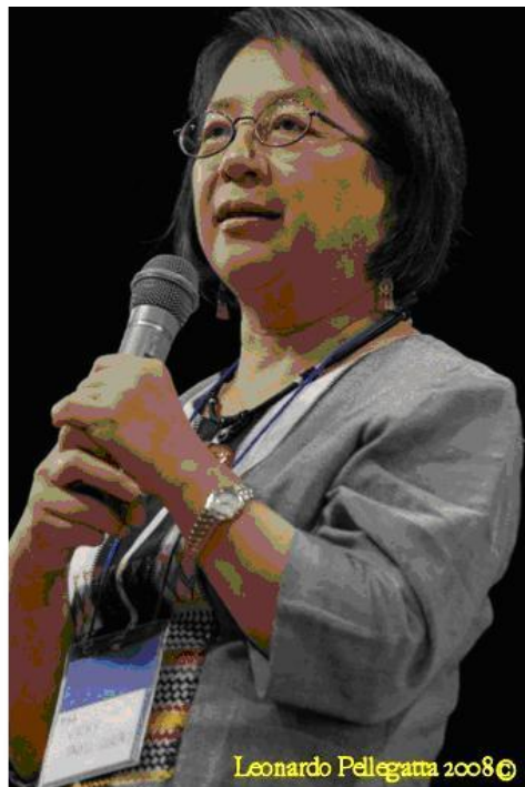
Tauli-Corpuz keynote on indigenous peoples and sustainability

Ainu alignment toward domestic action is in sharp contrast to the focus of IPS indigenous delegates who benefit from treaties and more progressive domestic policies. Many are involved with international organizing and trans-national ventures such as collaboration and leadership training; others serve as leaders of regional indigenous blocks and represent these constituencies in international contexts. They are therefore apprised of the techniques of international law and familiar with the vernacular of international legal-speak. Producing the Nibutani Declaration was an extension of ongoing work on the DRIP for international indigenous leaders.