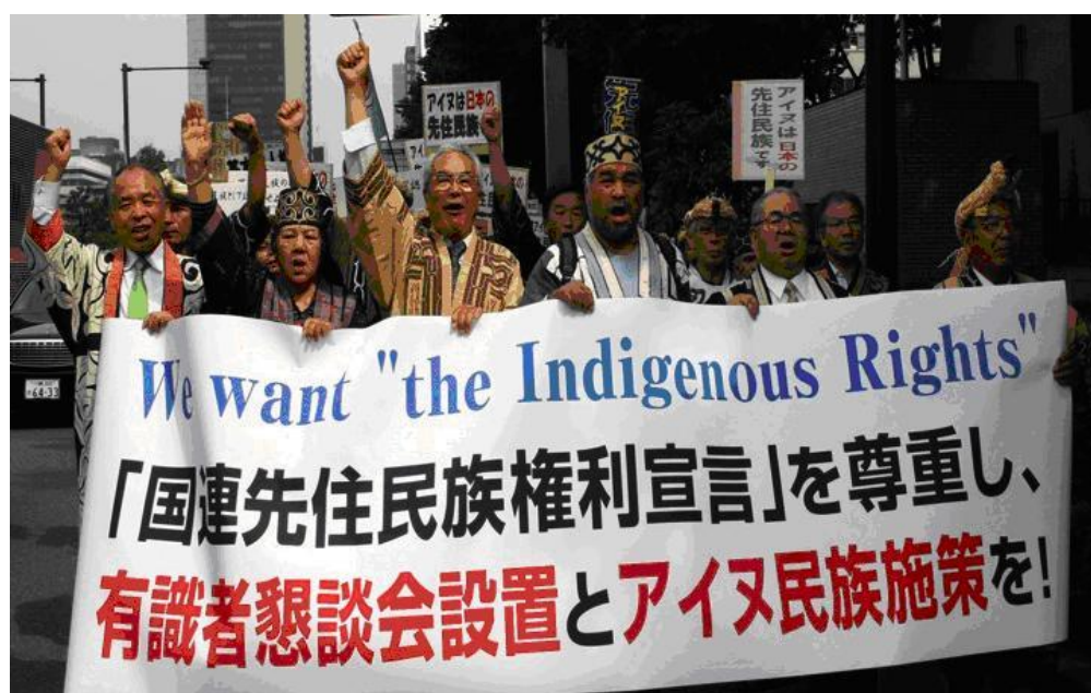
Tokyo: Mass Ainu March for Indigenous Rights, May 22, 2008

Adopting DRIP in September 2007 prompted a series of more aggressive-than-usual initiatives by Ainu organizations across Japan which gained momentum toward July and the opening of the G8 summit. In early 2008, the Tokyo-based Ainu Utari Liaison Group organized a petition drive in downtown Tokyo. [22] In May 2008, they delivered upwards of 6600 signatures to the Prime Minister together with the following requests: 1) that Ainu be recognized as indigenous peoples, 2) that the government issue an official apology to Ainu people, 3) that a nationwide survey of Ainu living conditions be enacted as a precursor to implementing a national policy; 4) that the Ainu Cultural Promotion Act (1997) be reviewed; 5) that a new Ainu/ethnic law be implemented; and 6) that a commission of inquiry be set up to design this Ainu/ethnic law. If the mounting domestic pressure were insufficient, international society added its own support in mid-May. During the Universal Periodic Review of Japan, member states in the UN Human Rights Council’s Working Group recommended the Japanese government initiate dialogue with Ainu and undertake a review of land and other legal rights of Ainu people as steps toward implementing DRIP in Japan. [23]