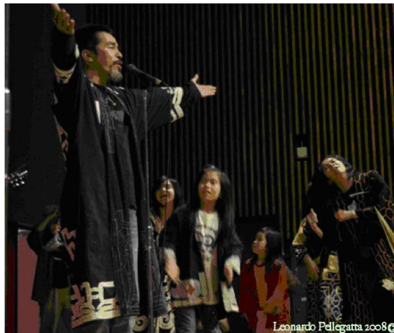
Ainu rock in the family: Ainu Art Project performs traditional songs with hard rock beat