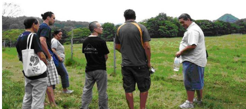
Maori delegation offers a prayer in respect for cinomisir and Ainu ancestors

In Biratori, the dam issue has been especially divisive within the Ainu community because many residents see these public works projects as deliverance from a sluggish economy and rural depopulation while a minority is concerned about cultural and environmental sustainability locally. Biratori Dam construction will necessitate submerging three sacred Ainu sites ( cinomisir ), 17 archaeological sites, and destroy habitat for Ezo Brown bears, an endangered species of falcon, and wild mountain vegetables which have sustained Saru River Ainu communities for centuries. The proposed Biratori Dam was also a focal point of the Environment workshop. During the IPS fieldwork program, a local Ainu elder led a tour of the dam construction site.