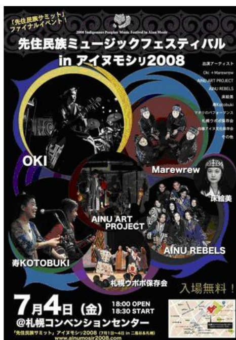
Indigenous Music Festival in Ainu Mosir 2008 poster (Design: W. L. Ding-Everson)

climate change, the global food crisis, high oil prices, increasing global poverty, and escalating violence around the world are all symptoms of growth-based economic models promoted by G8 nations and are therefore fundamentally unsustainable. The declaration urges non-signatory nations to approve DRIP immediately and asks that indigenous peoples be included in future climate talks and assessments to evaluate the impact of climate mitigation measures. Both documents were submitted to the Ministry of Foreign Affairs for distribution to G8 leaders and posted online. With these appeals now circulating globally, IPS organizers have now begun focusing specifically on recommendations to the government-established Expert Meeting in Japan, because this panel will determine future Ainu policy by July 2009. They will also continue to strengthen international ties established through the IPS to hold the Japanese government accountable to Ainu and fellow minority communities across Japan, and to indigenous peoples worldwide.