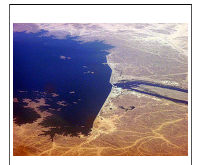
The Merowe Dam, Sudan, a Sinohydro Corporation Project

financing projects that no other financial institutions would fund", International Rivers and Friends of the Earth warned in July 2004.