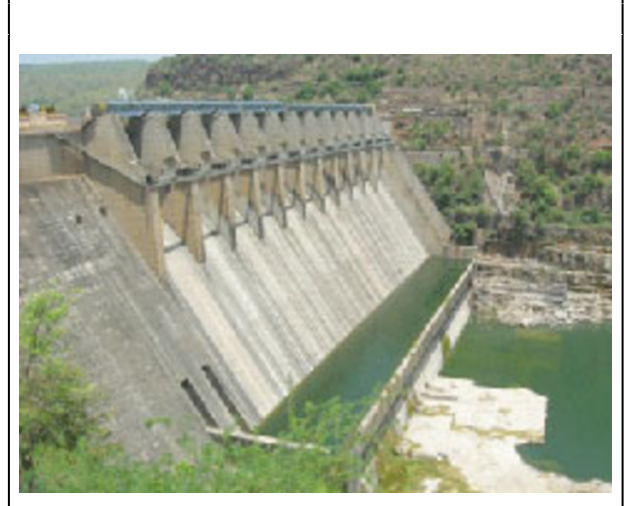
Nam Ngum 1 dam outside Vientiane

In a separate development, Sinohydro agreed to work together with the Global Environmental Institute, a Chinese NGO, in an effort to address the social and environmental impacts of the Nam Ngum 5 Dam, a $200 million hydropower project in Laos. Sinohydro also applied for a guarantee by the World Bank's Multilateral Investment Guarantee Agency (MIGA), evidently to learn more about how international financial institutions are applying their safeguard policies.