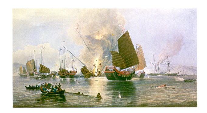
The first Opium War

large, mainland scholars embrace globalization, even while noting the challenges it poses to Chinese national identity, for they do try to distinguish it from Westernization.[10] The key difference between the two, according to these scholars, has a good deal to do with China's relations with them. China was forced to accept Westernization, which exerted impact through the course of modern Chinese history beginning with the Opium War (1839-42).