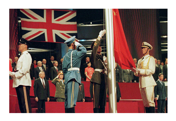
Hong Kong's 1997 "handover" from British to Chinese rule

Recent changes in Hong Kong's movie industry reveal the interplay of the global, the national and the local. Before 1997, the industry produced on average 300 movies annually. After 1997, production experienced a noticeable decline. At present, annual production is in double digits. But this decline belies the fact that Hong Kong movie directors have been as busy as ever, making movies not only in Hollywood and Hong Kong but also on the mainland. Indeed, China's movie market has become more and more internationalized. Hong Kong directors, now perceived as Chinese, have successfully ridden this wave. By and large, their entry has been well received by the mainland audience and welcomed by the government, for it is seen as a part of the "nationalization" referred to above. At the same time, Hong Kong directors have also left indelible marks in Hollywood. What these directors have achieved are examples of global collaboration, pulling together Hollywood techniques, Chinese stories, local resources as well as a cross-section