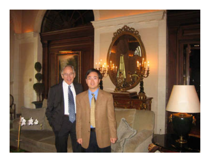
Toffler interviewed by People's Daily Correspondent

years extensive exchanges have occurred among the three, there have been notable differences in the ways in which scholars in China, Hong Kong and Taiwan have assessed the impact of globalization. These differences reflect the three regions' historical experiences and their current positions in the world. They also point to different expectations on the part of scholars and, to a lesser degree, the leaders of the three regions with respect to globalization. China is the most enthusiastic among the three, followed closely by Taiwan and then by Hong Kong. In China, (quanqiuhua; globalization) has become a catchphrase in media as well as in political and academic discourse. In fact, the Chinese embraced "globalization" even before the phrase "globalization" captured much attention and its study became an academic field around the world. During the 1980s when China had just opened its door to the outside world, Zhao Ziyang (1919-2005), China's premier and later party general secretary, instructed the party and the people that there was no choice other than pushing forward with economic reform. Inspired perhaps by the futuristic study of Alvin Toffler,[3] Zhao believed that the whole world has become a "global village" (digiu cun) and that China should seek to become a member.