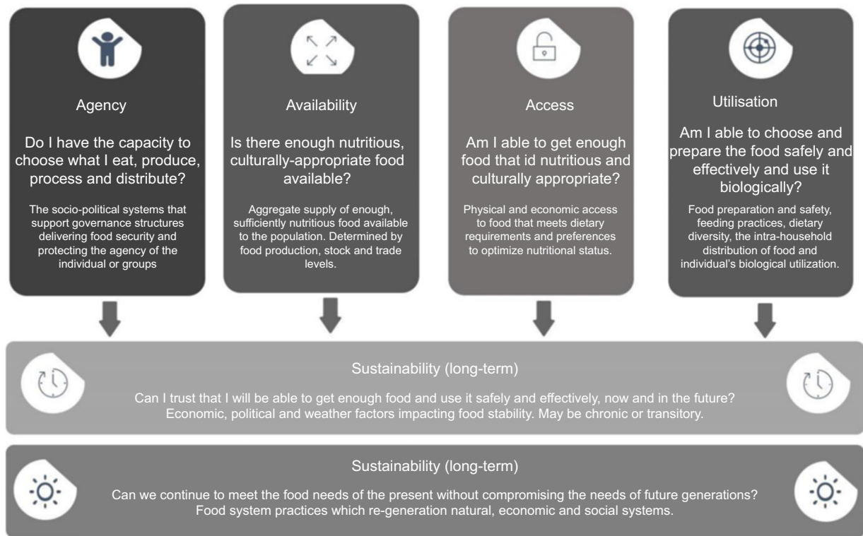
Fig. 1 The FAO Dimensions of Food Security*. *Adapted from Ashby S, Kleve S, McKechnie R, Palermo C. Measurement of the dimensions of food insecurity in developed countries: a systematic literature review. Public Health Nutrition . 2016;19(16):2887-96; HLPE. HLPE Report 15: Food security and nutrition: building a global narrative towards 2030. A report by the High Level Panel of Experts on Food Security and Nutrition of the Committee on World Food Security [Internet]. 2020 [cited 2021 February 3]; Rome: HLPE; Available from: http://www.fao.org/3/ca9731en/ca9731en.pdf

renting a house, having low socioeconomic status, receiving social assistance payments or being a member of a racial or ethnic minority (4,5) . As members of a racial or ethnic minority, refugees are vulnerable to FI. A refugee is defined as a person who has a well-founded fear of persecution in their home country and, as such, is unwilling or unable to safely return to it (6) . Unlike many migrant groups, refugees often also have low socio-economic status and live in rental or government-supported accommodation, further increasing their association with FI risk factors (7,8) .