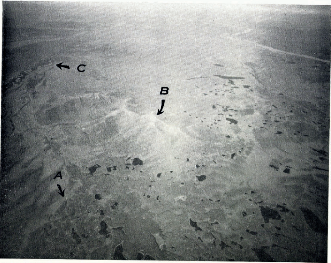
Fig. 4. Aerial view of the prominent front of the Snag Moraine east of Beaver Creek, looking north-east from an altitude of 5,334 m. A. Snag Moraine; B. Niggerhead Mountain; C. Beaver Creek.

Adjacent to Snag Road 15 km. south of Snag, an exposure of Snag till containing striated boulders up to 2 m. in cross-section and pebbles of granite, greenstone, hornblende-gneiss, amygdaloidal basalt, quartzite and andesite is mantled with 20 cm. of loess. The soil is oxidized to a depth of 25 cm. and permafrost is present locally 32 cm. below the ground surface.