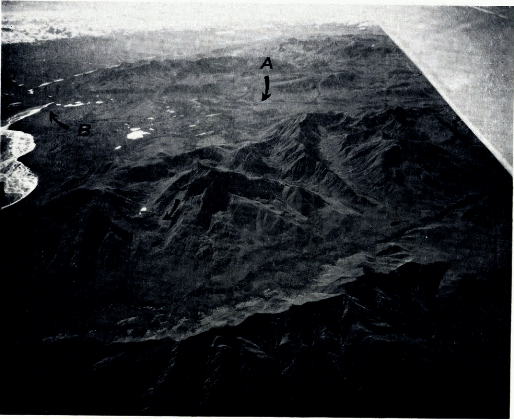
Fig. 5. Aerial view of Tchawsahmon Moraine, looking south-west from an altitude of 5,130 m. A. Front of Tchawsahmon (I) Moraine at Tchawsahmon Lake; B. Moraine from Russell Glacier at the mouth of upper White Canyon, equivalent to Tchawsahmon III; C. Post-Snag valley moraines and tarn lake (1,400 m.) 4.5 km. west of lower White Canyon.

glacier was up-valley from the forest. This suggests that the front of Klutlan Glacier receded at least 10 km. behind its present position prior to its most recent advance. Sharp (1951, p. 105) made a similar observation in the Steele (Wolf) Creek valley and suggested that this recession may have coincided with the post-Wisconsin altithermal (xerothermic) period. McConnell (1906, p. 20) reported that in 1905 a ridge of fresh uncovered ice appeared to be overriding the ablation moraine in the upper central part of Klutlan Glacier.