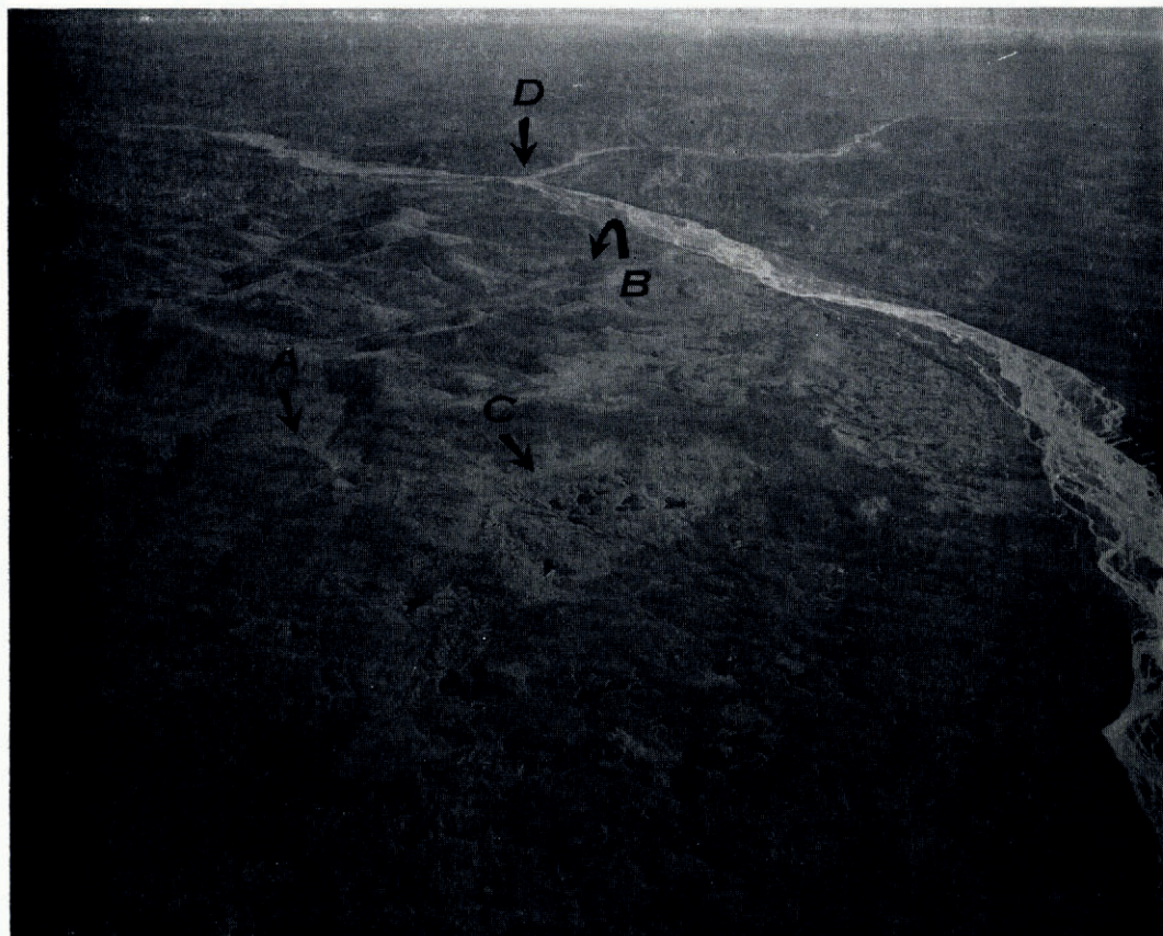
Fig. 3. Aerial view of the Klondike Plateau and White River Valley looking north-east from an altitude of 5,487 m. over the Wellesley Basin. A. Nisling Moraine; B. Nisling Moraine at mouth of Ten Mile Creek valley; C. Donjek Moraine; D. Junction of Donjek and White Rivers.

streams from Beaver Creek, White River and Donjek River coalesced in a broad lobe which was confined against the south flank of the Klondike Plateau. The broad valley 16 km. west of Mount Dave was blocked by ice and the impounded drainage formed a lake, the level of which may have risen to an altitude of 762 m. (Fig. 2). A large ice tongue spread northward 3.5 km. beyond the mouth of Donjek River. The east-flowing tributaries of the White River were diverted westward into the Tanana drainage and large lakes were impounded in the