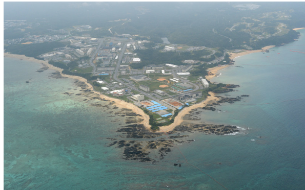
Planned site for relocation, May 2015.

What follows is a series of six short comments by Okinawans active in one or other aspect of the movement opposing construction of the new base at Henoko, offering their understanding of the March 4 th agreement.