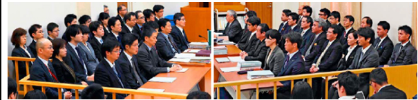
Lawyers representing the state (left) and Okinawa (right) in court, February 29, 2016.