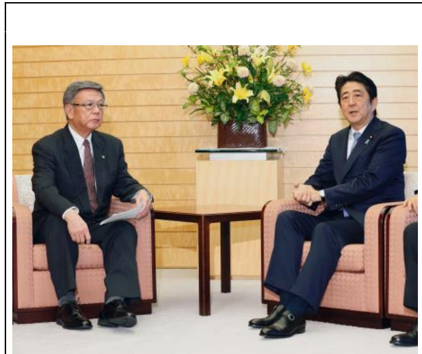
Announcement of "Amicable Agreement," March 4, 2016.

would discuss and seek "satisfactory resolution" pending the final outcome of judicial proceedings, and both would then abide by that final outcome; in other words, the Governor would promptly carry out whatever the court ruled, even if he thought it wrong, and would revoke his October 2015 order without further ado.