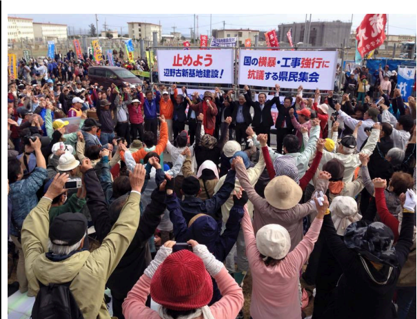
Protest against Henoko base, February 2015.

Despite the presidential calm, anger in Washington is palpable as the date for fulfilment of the Japanese pledge keeps being pushed back, and as the most pro-American government of recent times fails to deliver on its repeated promises of closure. As Admiral Harris noted, of 200 base transfer-related items carried in Japan's 2015 budget, just nine had been completed with eight more still underway, and the situation at the Henoko site was not improving but rather protest was "continuing to escalate." 7 On the Japanese side too, as Abe and his circle found their plans for base construction blocked by stubborn Okinawan opposition, frustration mounts. Both Washington and Tokyo recognize that there is no end in sight to that struggle. The world's major powers had been unable, for almost two decades, to impose their will on the 1.4 million people of Okinawa. It is inconceivable that the head of any other local self-governing body in Japan should refer, as Okinawa's Governor Onaga did in 2015, to the government of the country as "outrageous" ( rifujin ) or "depraved" ( daraku ) and (as he did before the United Nations Human Rights Commission) as "ignoring the people's will." 8