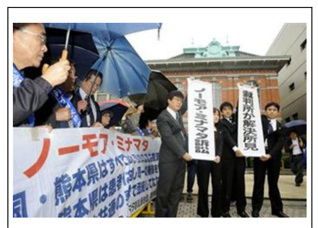
"No more Minamata" protestors during the 2010 court case

Supreme Court decision in a case pressed by patients who had refused to drop their lawsuit. The court found the government's certification standards too strict, and found the prefectural and national governments at fault for allowing the disease to spread after it was discovered. The government refused to relax its certification standards, and thousands more applied for certification or filed lawsuits. In 2010 the government reached agreement on a plan to compensate many more people—possibly bringing the total up to 35,000—but many lawsuits continue.