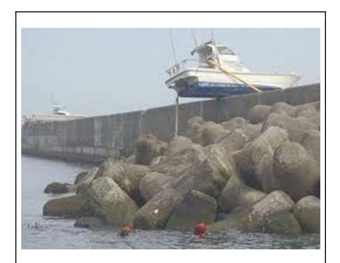
In Tohoku, seawalls and tetrapods were overwhelmed

does offer some lessons, positive and negative, to those in a position to decide, and some hints to observers of what we should watch for. The two disasters are not completely different, as some might assume because they see the Higashi Nihon daishinsai as a "natural disaster" and Minamata as manmade. Rather it is the mutual influences of human beings and nature on each other that make natural disasters.