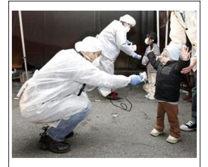
Children measured for radioactivity following the March 11 disaster

Both Minamata and March 11 polluted the sea and took the lives or destroyed the livelihoods of many people who had depended on fishing, often for generations. Those who were still able to fish found themselves unable to sell their tainted catch.