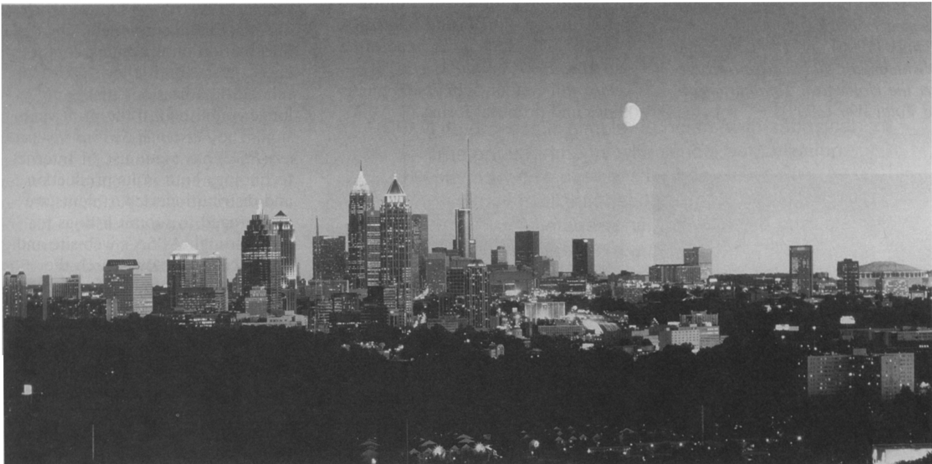
Heart of the South: The Atlanta skyline featuring the stair-shaped Georgia Pacific building, the CNN Tower, and the Georgia Dome.

Atlanta Braves www.atlantabrades.com Zoo Atlanta www.zooatlanta.org Centennial Olympic Park www.gwcc.com/parkinfo.htm The World of Coca-Cola www.webguide.com/coke.html