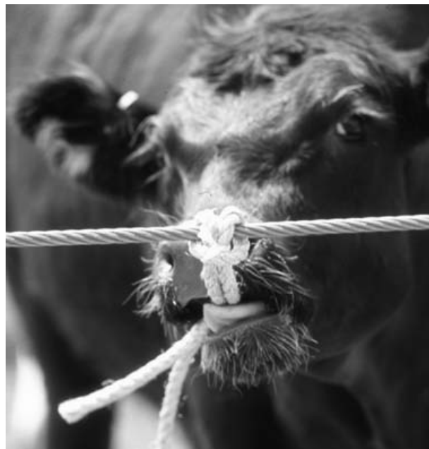
Fig. 1. Feedlot steer contacting the rope device. The device was prepared from manilla rope and was mounted over feed-bunks and water-tanks. Curious cattle deposit micro-organisms onto the ropes while rubbing, licking, or chewing.

Culture methods were specific to the type of sample, but they included selective enrichment, immunomagnetic separation and agar plating. Identity of each isolate was confirmed by standard methods including PCR. Methods for recovery of STEC O157 from individual and composite fecal samples were modifications of those recently reported [6, 7]. A total of 10 g of faeces were incubated for 6 h at 37 °C in 90 ml GN broth containing 8 µg/ml vancomycin, 50 ng/ml cefixime and 10 µg/ml cefsulodin. Subsequently, 1 ml of this culture was subjected to O157 immunomagnetic separation (Dynal, Lake Success, NY, USA) and 50 µl of the bead-bacteria mixture was spread onto sorbitol–MacConkey plates containing cefixime (0.05 µg/ml) and potassium tellurite (2.5 µg/ml)