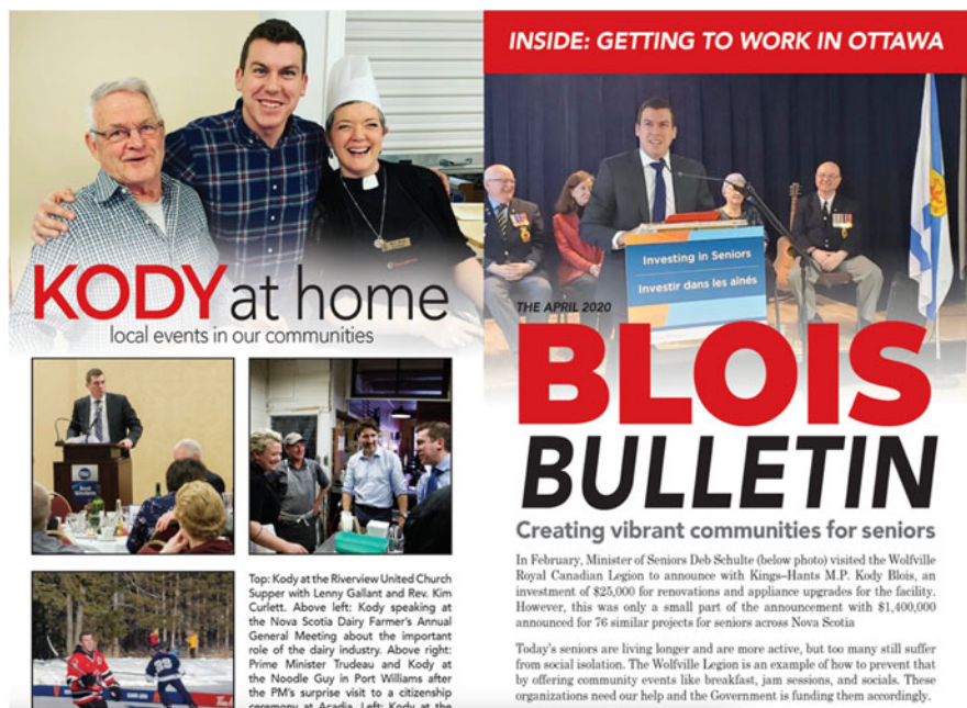
Figure 1. Householder front page (householder of Liberal MP Kody Blois, Kings-Hants, April 2020)

this time, constituency casework skyrocketed as MPs and staff assisted constituents in distress and those who needed help accessing emergency government programs (Koop et al., 2020). However, MPs were unable to attend the public gatherings and events that are content fodder for householders.