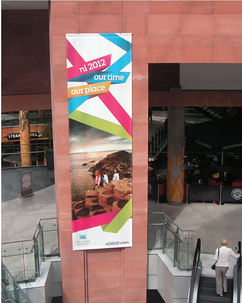
Figure 6. Belfast streetscape with campaign artifacts visible. Our Time, Our Place—2012.

to gesture toward each other. It's very much a matter of laying down upon the existing grid of streets a blueprint for an idealized "new" Belfast—albeit one that would be unrecognizable to itself. What is it trying to replace?