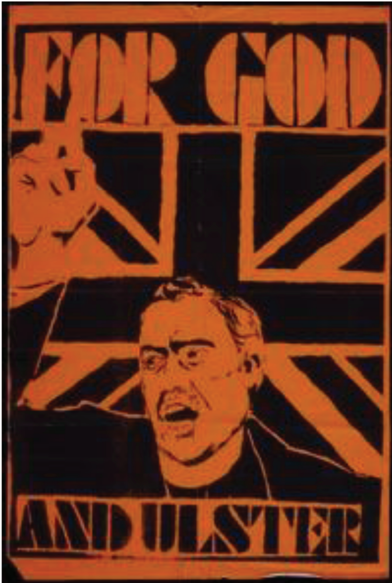
Figure 12. Rev. Ian Paisley, silkscreen poster, 1960s Troubled Images exhibition catalog (Linen Hall Library, 2001). Poster attributed to Patrick McGrath.