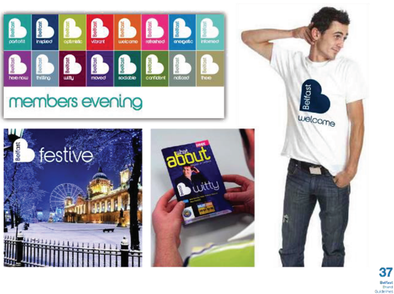
Figure 13. From the Belfast rebranding brief

Both the Be-Happy rebranding and the already existing system for the calendrically mediated display and desecration of one another's sectarian sacraments are regimes of visually and chromatically mediated interdiscursivity: token sites bearing significant color configurations gesture to each other as each and all gesture toward a type-level source of taxonomic identity. In both systems, the signs can be displayed in places and can be worn on the bodies of