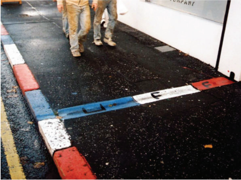
Figure 7. Sandy Row, Belfast (2004). http://cain.ulst.ac.uk/cgi-bin/murals.pl , album no. 64, mural no. 2241. © Dr. Jonathan McCormick.

flags or emblems provides an especially good example of the “institutional thickness” that Neill (2010, 307) identifies in Northern Ireland generally: