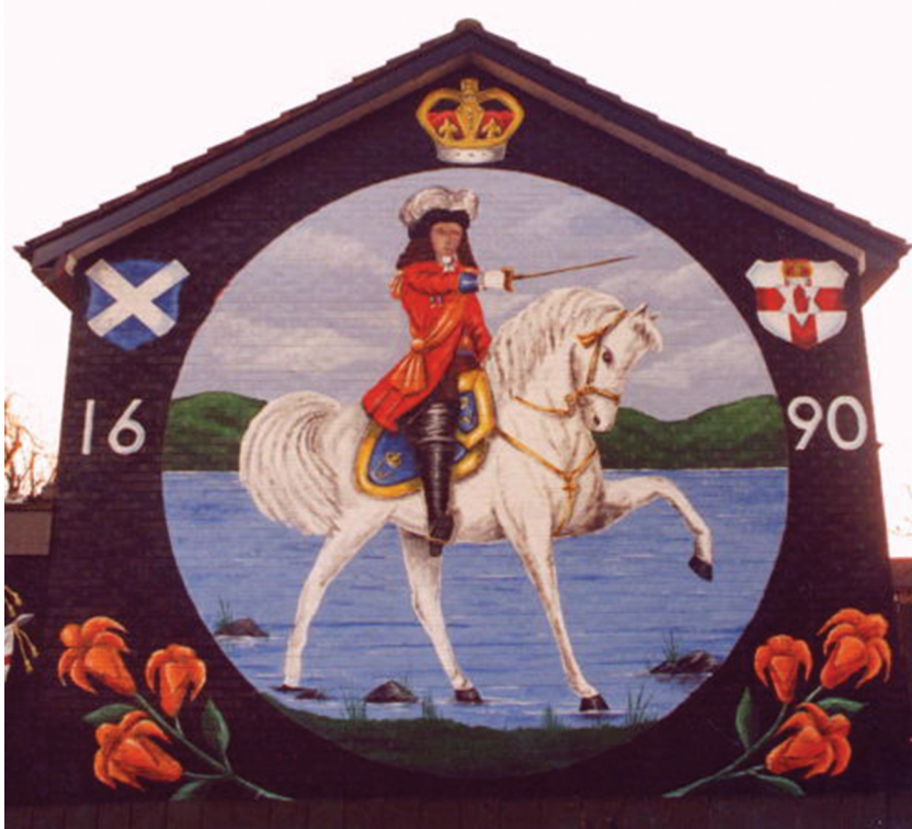
Figure 11. King Billy and his white horse. http://cain.ulst.ac.uk/cgi-bin/murals.pl , album no. 55, mural no. 1932. © Dr. Jonathan McCormick.

not the same color. The orange of Ian Paisley in this 1960s silkscreen print (see fig. 12) is the same as the orange in the Irish Tricolour flag insofar as they both “literally” signify the Protestant community—but they are not the same color. The context is different: in the Tricolour, Protestant orange is positioned on the other side of peaceful white from green Catholicism (see fig. 10). This image of Paisley is an all-over orange image—there’s even an all-orange Union Jack in the background. This helps to explain why people in the Republic of Ireland sometimes insist that “gold” is the name of this color in the Irish Tricolour—and they have a point. Regardless of the “objective” characteristics of color (PANTONE 151), it’s not the same color, so it really should have a different name. The use of the color orange as a symbol of Unionism-Loyalism-Protestantism, one should note, is rooted in language—more precisely, in the aristocratic title carried by King William and others, which refers to the medieval European principality (and eponymous noble House) of Orange in southern France. The word came first, the color later, in other words.