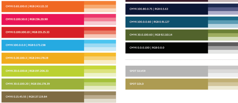
Figure 5. Our Time, Our Place—color palette

When there is the need for RAL or Pantone colours, the best possible match should be found.