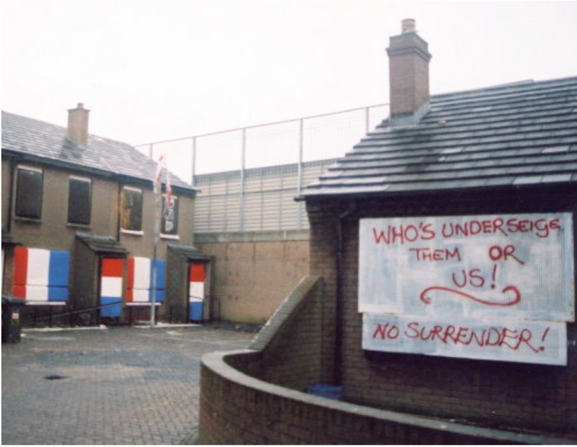
Figure 8. Cluan Place, Belfast. http://cain.ulst.ac.uk/cgi-bin/murals.pl , album no. 45, mural no. 1546.

parading—can be (legally) construed as “threatening, abusive or insulting words or behavior . . . intended to stir up hatred or arouse fear,” or if same is “likely to be aroused thereby,” to quote from Article 9 of the Public Order Act of 1987, still in force. And this applies whether those symbols are being propitiated, or ritually desecrated (Bryan and Gillespie 2005, 17, 23, 24).