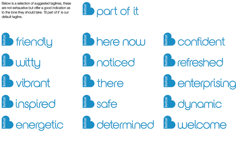
Figure 2. Taglines

Below is a selection of suggested taglines, these are not exhaustive but offer a good indication as to the tone they should take. ‘B part of it’ is our default tagline.