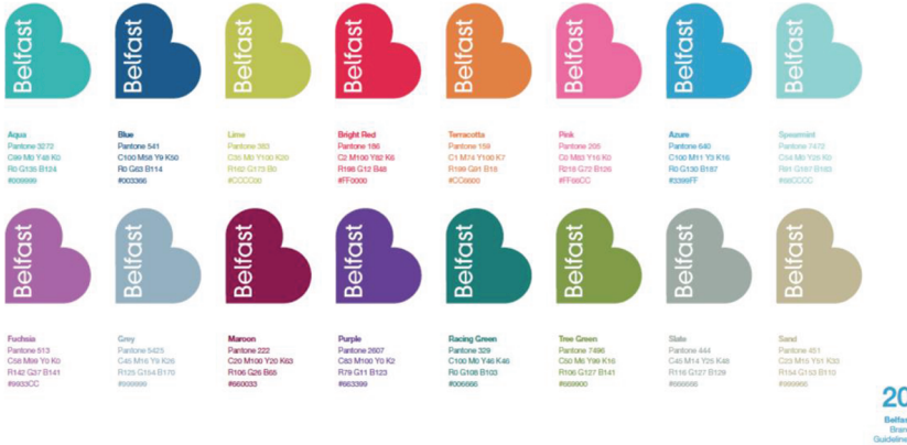
Figure 3. Color palette

When a tagline appears with the logo both should remain the same colour.