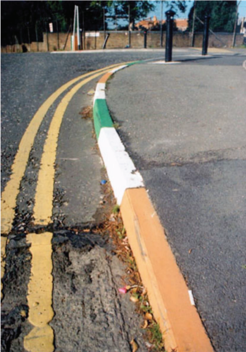
Figure 9. Levin Road, Kilwilke, Lurgan, Co. Armagh (2006). http://cain.ulst.ac.uk/mccormick/photos/no2930.htm#photo . © Dr. Jonathan McCormick.