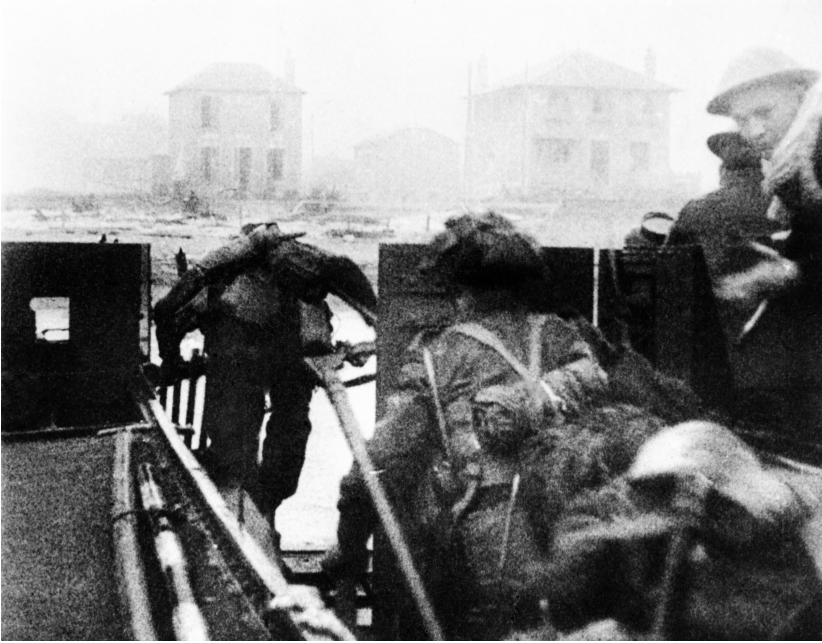
Illustration 13.1 Troops of 3rd Canadian Division disembark from a landing craft onto Nan Red beach, Juno area, near St Aubin-sur-Mer, at about 0800hrs, 6 June 1944, while under fire from German troops in the houses facing them.

squadrons assigned to attack beach targets found the winds and over-cast skies a serious challenge. 99 The bombardment from the sea was only marginally more effective. Major John Fairlie, a Canadian artillery officer, who conducted an exhaustive investigation of Juno beach after the battle, concluded later that naval fire had done ‘no serious damage to the defences’. 100