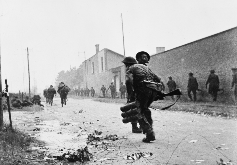
Illustration 13.2 British Commandos advance towards Ouistreham, Sword area, 6 June 1944. In spite of the notable feat of arms of D-Day, controversy still rages over whether British and Canadian forces should have pushed more aggressively inland to take their D-Day objectives.

commanders in Normandy. 141 A more dynamic approach once the beaches had been taken would have required Second Army to utilise its battle drills in preference to firepower-heavy tactics. 142 In the complex, fearful environment of D-Day, this was an unrealistic expectation. 143