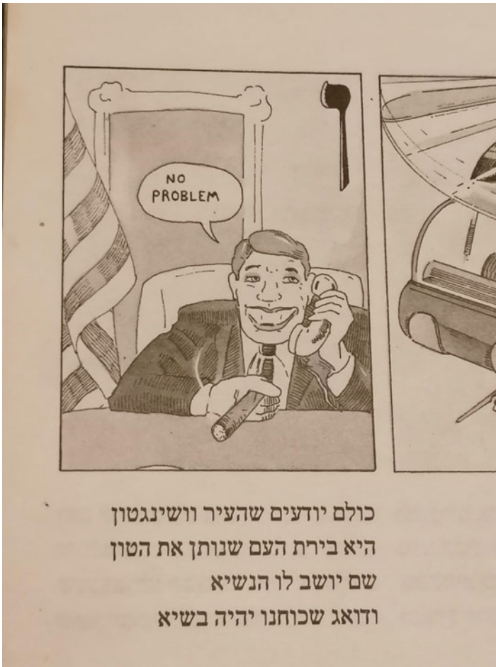
Figure 5. Detail from Dudu Geva, “ABC: Our Security” (“Aleph Bet Bit’honenu”), in Geva, Deserted Thorn (Dardar ba Midbar) (Jerusalem: Adam, 1984).

Hebrew lexicon of Israel’s security fetish identifies the American President as the willing enabler of the carnage and buoyant nationalism celebrated in the neighboring sketches. Israelis often took pride in American admiration of Israel’s military exploits. 61 In comics form, Geva audaciously called out Israeli militarism and American careless support for Israel’s vast military apparatus, in ways that very few of his contemporaries dared to do.