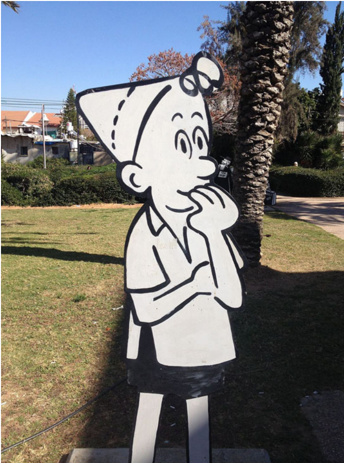
Figure 3. “Srulik” in the museum of cartoons and comics in Holon, Israel. Photograph by Yair Talmor. License Link: https://commons.wikimedia.org/wiki/Commons:GNU_Free_Documentation_License_version_1.2 .

story, no longer himself. Geva took Donald Duck far away from home, turning him into a dirty Sabra trickster.