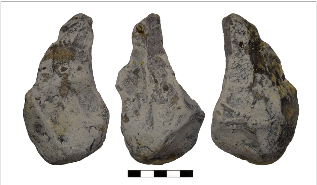
Figure 3. Trihedral pick from the beach at Yeşil Liman.

bifacial tool was recorded (Figure 5). This is made of a yellowish volcanic rock and retains cortex across most of one surface, while the other is more intensively flaked; its rough, crude form suggests that it is Lower Acheulean. Several pebble core tools and Levallois