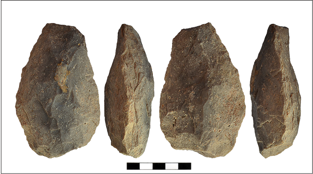
Figure 4. Bifacial tool/handaxe from Kirsedere Valley.