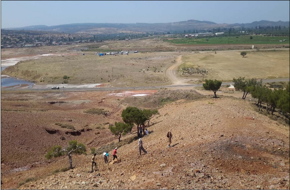
Figure 6. Pedestrian survey of the Tuzla findspot.

cores were also recovered, along with denticulated and retouched tools that were mostly produced from large flake blanks.