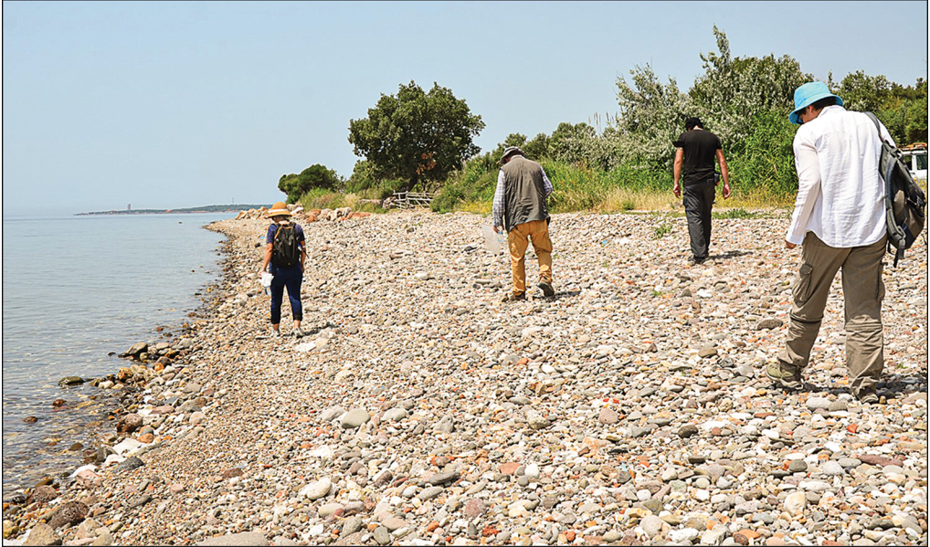
Figure 2. Pedestrian survey of the beach at Yeşil Liman.