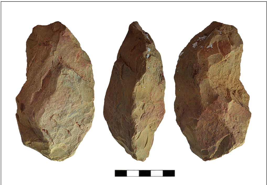
Figure 5. Bifacial tool/handaxe from Tuzla.