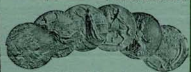
Gold Medal (Highest Award), Allahabad 1910.

GRANDS PRIX: Paris 1900, Brussels 1910, Buenos Aires 1910.