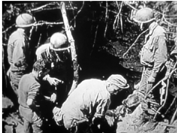
American soldiers at the mouth of an evacuation cave