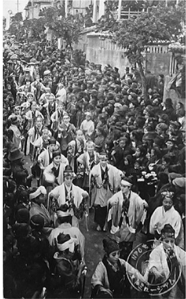
Annual Parade of Tsuji courtesans before World War II