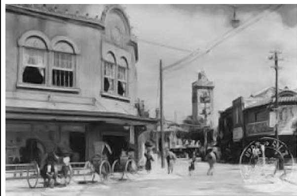
Naha before World War II