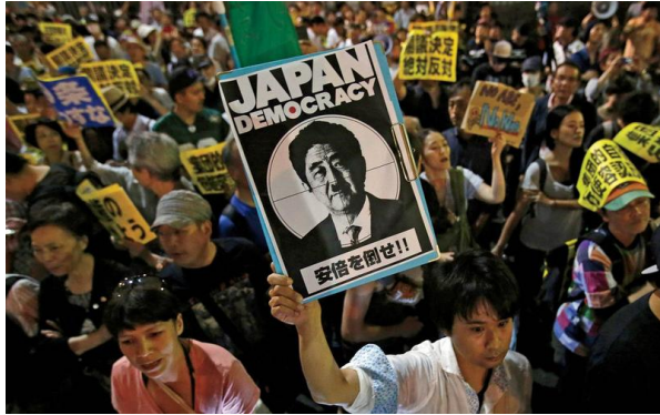
A wave of protest against Prime Minister Abe's call for constitutional revision.