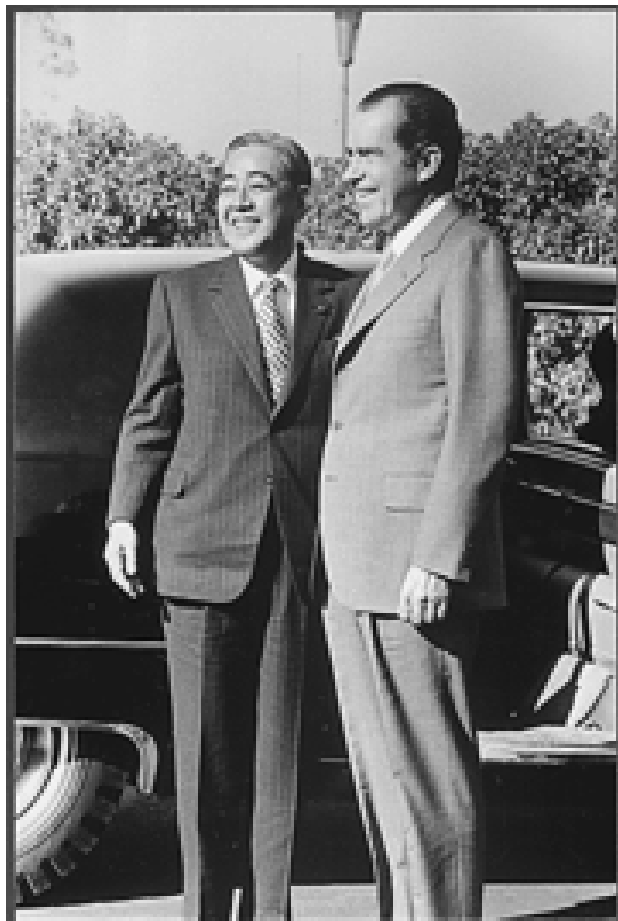
Japanese Prime Minister Eisaku Sato (left) negotiated with Richard Nixon for the return of Okinawa to Japan