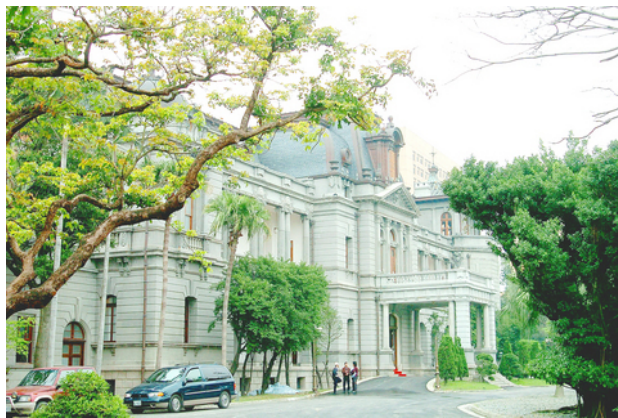
The Taipei Guest House

in September 2006, the DPP government does not mention the 1952 treaty; the sole exception states that the treaty has not settled Taiwan's legal status but that Taiwan has de facto sovereignty. In short, the DPP continues to teach the coming generation that Taiwan's status is not settled. Without using the longue durée interaction between China and Japan to determine Taiwan's historical alignment, as presented in this essay, the significance of the 1952 treaty for defining Taiwan's legal status cannot be fully comprehended.