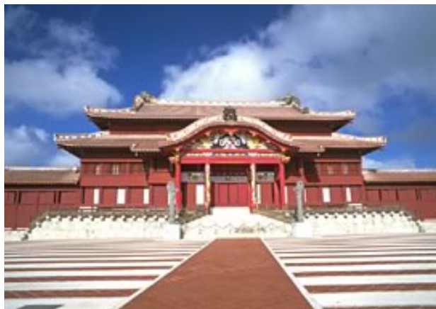
The Shuri castle

Traveling through East Asia, one can view historic imperial palaces in Beijing and Tokyo, and royal palaces reconstructed from the ruins left by fire and war in Seoul and Naha. Okinawa is the largest island in the Ryukyu archipelago. The Shuri palace in its capital, Naha, was constructed more than six hundred years ago by the rulers of the Ryukyu kingdom, which played a crucial role in maritime East Asia from the fourteenth to the seventeenth centuries. Today, it takes barely an hour to fly from Taipei to Naha, and the Shuri castle, reconstructed three times in the last century, has been designated a World Heritage Site in an attempt to evoke its former grandeur.