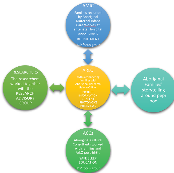
Figure 2. Pathways, process, and research partnerships

women talked of babies being safe on the ground in their Pepi-Pod ® during trips out to the clothesline.