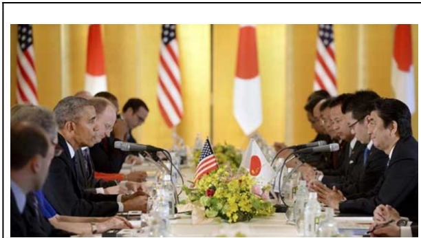
Some green on the table, in this photo, but not the green we need...

the table between Abe and Obama. The big stumbling block confronting the green alliance is Team Abe's clear reluctance even to talk about green power.