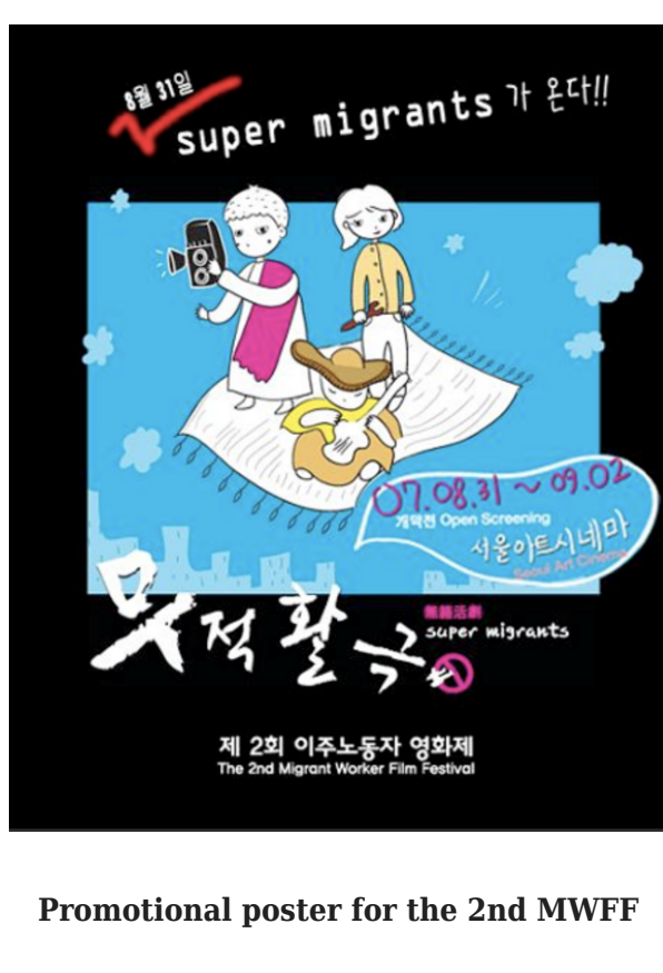
Promotional poster for the 2nd MWFF

Although other festivals in Korea and elsewhere occasionally cover migrant workers' issues, the MWFF is unique in that it focuses exclusively on a broad range of topics specifically related to migration. Through documentaries, comedies, dramas and other genres, audiences are introduced to films that show how migration intersects with issues of labour, human rights, race, education, culture, and gender. Numerous amateur productions by first-time Korean or migrant directors are screened alongside international or domestic feature length films. Through the screening of films, and the cultural performances and parties that are also part of the MWFF, this traveling festival expands the discussion about migration beyond what is possible with MWTV's regular programs.