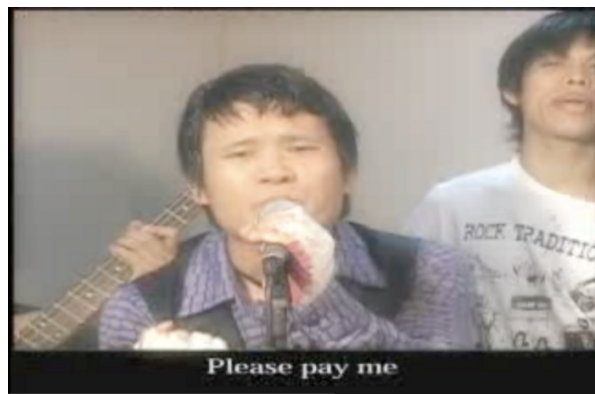
Still from the Stop Crackdown Video, Payday.

that Never Comes.” In Stop Crackdown’s ‘Payday’ video, migrants facing similar conditions belt out a chorus that concludes with the line “Oh Boss, give me my pay.” Similarly the space of Stop Crackdown’s performances also resonates with the Minjung cultural movement, 1 as they are a fixture of contemporary social movement rallies (both the migrant and irregular workers movements and other social struggles), performing at movement events and at a locations (such as Marrioner Park, Myeoungdong Cathedral, etc) of historical significance to previous democracy movements.