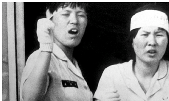
"Money for our backbreaking work... Money that Never Comes." [Still from Light of a Factory , DVD version, 2006, Hakchon Music]

In 1979, Kim Min Gi and other activists from South Korea's democracy and labour movements clandestinely released the collective radio play "Light of a Factory" ( Kongchang'ui Bulbit ). This work was used to mobilize factory workers into the broad-based minjung or people's movements that were challenging the dictatorship. The play documented the lives of Korean workers and the suppression of their desires under the authoritarian regime. The plot centered on female workers in an export factory who decide to organize a union. It was loosely based on real struggles such as the massive strike by female employees at the Y.H. Trading Company in 1978-9; a strike which spilled over into the struggles of the Korean democracy movement. The music was a cacophony of different styles and influences: from US camptown progressive rock, to Western and Korean folk music, to shaman ritual and other traditional styles. Cassettes of the play were rerecorded on home stereos and passed around from hand to hand.