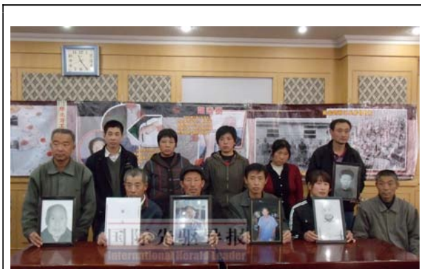
The five plaintiffs in the Shinanogawa lawsuit against Nishimatsu, along with heirs of two other victims, announce their opposition to the compensation pact at a Beijing press conference on April 27.

The truth is that all the plaintiffs of the Nishimatsu-Shinanogawa forced labor lawsuit in Japan, who were confirmed by both Nishimatsu and the plaintiffs' Japanese attorneys in June 2009 as the representatives to negotiate with the company, did not sign any settlement agreement with Nishimatsu. The root cause for this are: (a) Nishimatsu insisted to state in the content of the Nishimatsu-Shinanogawa Settlement Agreement [2] that "Chinese people's right to claim had been waived", but did not allow the plaintiffs to express side by side in the Settlement Agreement that they could not accept this wrong viewpoint; (b) In order to make clear its unyielding position of not taking any legal liability, Nishimatsu deliberately uses the term "atonement money (償い金)" to ambiguously name the damages that they should have paid to the Chinese victims; and (c) Moreover, Nishimatsu unreasonably requires those who accept the "settlement" to bear hereafter the obligation of ensuring that the corporation will be immune from any future liability from any other parties for this case. This article discusses these and other shortcomings of the unacceptable "settlement" in detail.