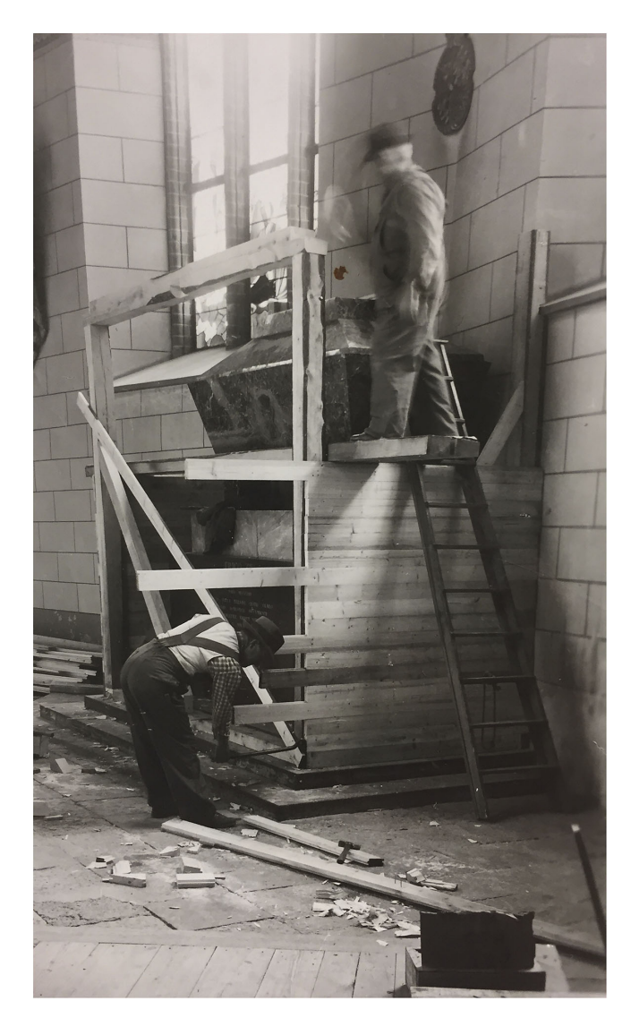
Image I. A protective structure is being built around the tomb of King Erik XIV in Västerås Cathedral, April 1940. Courtesy of Västmanlands Läns Museum, Vlm-A 658. Photographer unknown.

population's resistance and strike directly at the enemy's economy. Even if there had been international negotiations about the possibility of limiting the extent of future aerial warfare, the great powers were unwilling to refrain from using the full potential of bombers. Invaded or not, cities and industrial centers could easily be bombed from the air by enemy bases located on the opposite side of the Baltic Sea. Beginning in 1937, an organization for air raid protection was built, which followed the German model. Swedish territory was divided into four classes of air protection zones depending on the threats