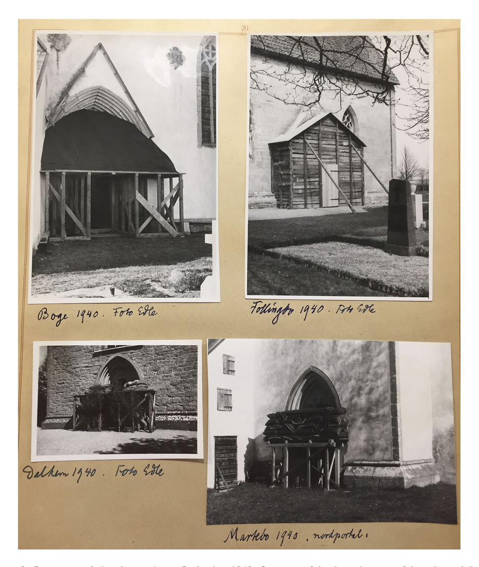
Image 2. Protection of church portals on Gotland in 1940.

A public inquiry was set up to study the matter of church and total defense. By involving the Church in total defense, the state primarily wished to secure the population's pastoral care and the Church's administrative functions in wartime. The protection of cultural property was, at best, a secondary goal. Protection of church property was included in the inquiry's report, Kyrklig beredskap (Eccelesiastical Preparedness), published in 1965, recommending that, among many other changes, the government should issue advice on the duties of parish priests regarding archival care and the protection of churches and their objects.