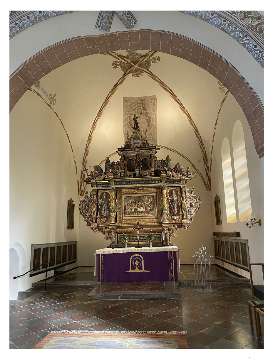
Image 4. Example of the interiors of a Swedish church: the choir and 17th century altarpiece of Åhus church.

times of war was criminal. However, to date, no site in Sweden falls under enhanced protection, and there have not been (as of February 2024) any systematic actions taken addressing the precautions in Protocol II of "the preparation for the removal of movable cultural property or the provision for adequate in situ protection of such property." ^{71}