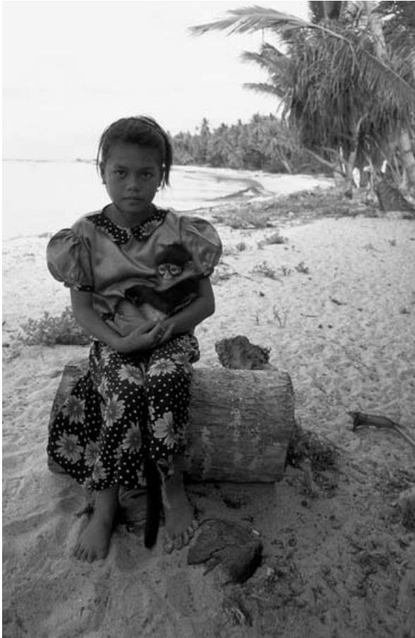
Plate 1 Natuna leaf monkeys Presbytis natunae make popular pets on the island of Bunguran and would be an ideal flagship species for the promotion of wider biodiversity conservation.

Natuna leaf monkeys are rarely hunted, as they are not perceived as pests, nor are there any indications that they are hunted to obtain valued bezoar stones (visceral secretions found in some species of Presbytis that are used in traditional medicine and are highly priced). Five Natuna leaf monkeys were found held as pets by villagers or local government officials (Plate 1). We looked for pets only in the main populated area around Ranai and Ceruk; in all likelihood more pets were held on the island, but extrapolations are not possible because we do not know how many households were covered by the networks of informants who told us of pets. Three of the pets were juveniles of 1–12 months of age and two had reached near-adult size. According to the people interviewed juveniles can be reared as pets, but captured adults can also be held in captivity and become relatively tame. The lifespan of these pets is usually <1 year for juveniles, but longer for individuals captured as adults. Most monkeys are captured haphazardly near settlements or in forest gardens (a forest