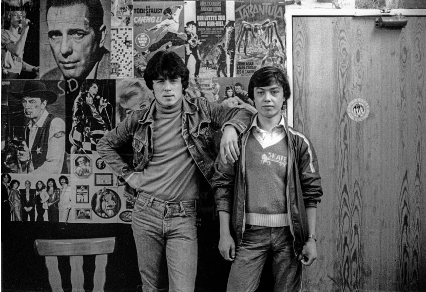
FIGURE 6.3 Turkish teenagers in denim pants, mocked as “ Almancı children” in their home country, mid-1980s. Behind them are posters expressing their interest in American and European popular culture: Humphrey Bogart in Casablanca (1942), Gary Cooper in the western classic High Noon (1952), the American horror film Tarantula (1955), the Bruce Lee film Fist of Fury (1972), Freddie Mercury performing in Queen’s 1977 world tour, Miss Piggy from The Muppet Movie (1979), and the German Eurodisco pop band Dschinghis Khan, which won fourth place at the 1979 Eurovision song contest.

Long derided in Turkey as “Germanized” and suffering from cultural estrangement, the returning children and teenagers struggled with experiences that were as much public as personal. Amid the mass exodus of 1984, Turkish references to “ Almancı children” became more frequent and disdainful, often mocking their perceived Europeanization and even Americanization (Figure 6.3). That year, production began on the satirical film Katma Değer Şaban (Value Added Şaban), starring comedic actor Kemal Sunal as a teenager named Şaban who returns to Turkey after spending his childhood with relatives in West Germany. 14 Immediately, the audience sees Şaban as an object of ridicule. He arrives at the Istanbul airport sporting an outlandish outfit influenced by the 1980s punk music