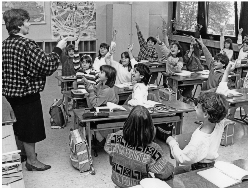
FIGURE 6.5 Reflecting return migrants' praise of West Germany's "democratic" teaching style versus the "authoritarian" education in Turkey, Turkish children in a West German preparatory school eagerly raise their hands, 1980.

where he was allowed to raise his hand, participate, and "contradict" the teachers (Figure 6.5). "Discussion is the foundation of democracy," he insisted. "One cannot educate through orders. One must persuade." 60 Another boy from Nuremberg called his experience at Turkish schools "a type of slavery" and complained that the Turkish education system was "not modern." "If I want to have a modern education," he quipped, "I have to go to Germany." An eighteen-year-old at the private Ortadoğu Lisesi described his school days as psychological torment that was "brainwash[ing]" him into obedience: "All nerves are under pressure ... To be able to survive here, one must not speak, not see anything, and of course not hear anything." 61 A German teacher who worked with returning children connected this stifling of discussion to the question of Turkey's status as a democracy following the military coup: "The Turks