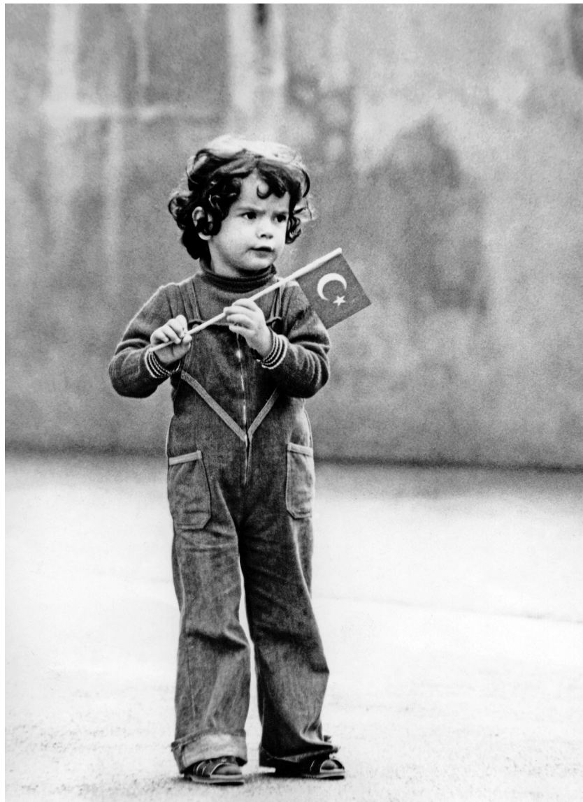
FIGURE 6.1 A young Turkish child in West Germany waves the Turkish flag – a symbol of his identity and connection to his home country, 1979.

generation” who barely spoke Turkish and had abandoned Islam. The Turkish government, having spent a decade opposing guest workers’ return migration and doing next to nothing to promote “reintegration,”