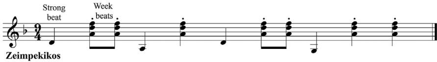
Figure 1. Playing d minor chord in the Basokitharo style. Zeimpekikos is a typical rebetiko dance rhythm in 9/4 (by author).

(E 2 -A 2 -D 3 -G 3 -B 3 -E 4 ), 7 and demonstrating a dual identity: firstly, it functions as a solo instrument for the main melody in the high strings; secondly, and prevalently, it rhythmically accompanies the melody through the playing of chords, drones, or at times producing bass melodic lines between the rhythmic accompaniment in a sense of heterophony. The second identity is a kind of plectrum style that could be called basokitharo 8 (“bass-guitar” in English), an idiomatic playing of individual low notes on the strong beats and of the chords or triads on the weak ones, with picking starting from the middle to the high strings with one staccato stroke (Figure 1).