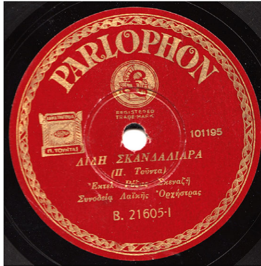
Figure 8. Gramophone record of “Lili skandaliara”, composed by Panagiotis Toundas.

multi-faceted musicianship who composed in a variety of genres (zeimpekikos, tango, foxtrot, etc.). He had a profound knowledge of makam tradition, was considerably skilled on the mandolin, possibly participated in the so-called estudiantinas (a type of mandolin-based orchestra of European origin, mostly associated with Ottoman Greeks, performing various repertoires, see Kounadis 2003:266–83, Ünlü 2004:169–74, and Ordoulidis 2017:102–4), and served as a record company promoter, producer, and director in Athens until 1940, when the Axis occupation of Greece began. According to unverified conjecture by Hatzidoulis (n.d.:38), before 1922 Toundas had sojourned for years in Ethiopia and Egypt, where his teacher was said to be Kemeñçeci Vasilaki Efendi (1845–1907), a Rum composer of Ottoman classical music.