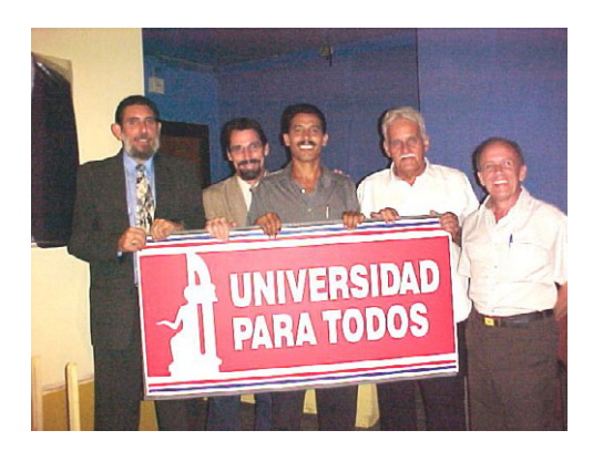
Figure 4. Staff for University for Every Body course of astronomy