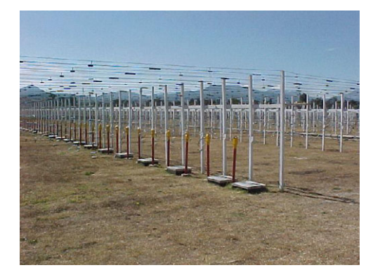
Figure 3. Scintillation telescope MEXART of IG-UNAM